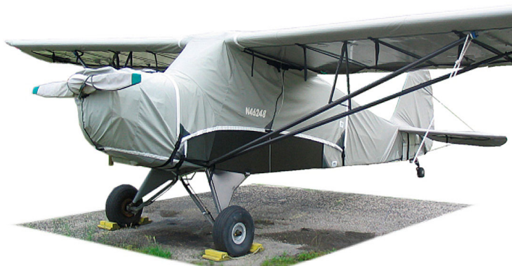
Prop Cover, Engine Cover, Canopy Cover, Wing Covers and Empennage Cover

WINTER USE MATERIAL - Made with Solution-Dyed Polyester fabric, this option is intended for seasonal use to aid in deicing, rain mitigation, or for occasional travel. The material is lighter and more compact, but more susceptible to UV damage and may have a shorter useful life if used continuously outside than the all-year use material.