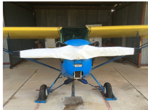
Taylorcraft L-2 Grasshopper Propellor/Spinner Cover