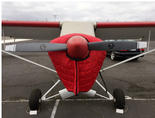
FOR INTERIOR USE. Cub Crafters CC-11 Insulated Hangar Blanket, available in Red or Silver

This cover type is made from Silver Acrylic Sunbrella canvas and is 100% lined with a soft and smooth microfiber. Bruce's Custom Covers developed this material combination especially for aircraft protection. The outer material is medium weight and treated for water resistance, UV resistance and anti-static buildup. The inner lining is a very soft and smooth microfiber to prevent scratching. The material is very reflective, and tests show that the cabin interior temperature can be reduced to near-ambient temperature on the hottest of days. It is water, ice and snow repellent, yet breathable to allow moisture to escape from between the cover and the aircraft surface.