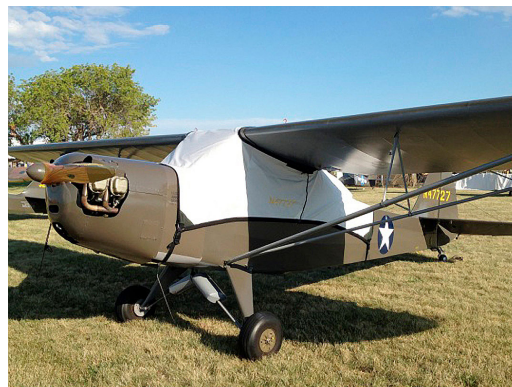
Taylorcraft L-2 Canopy Cover