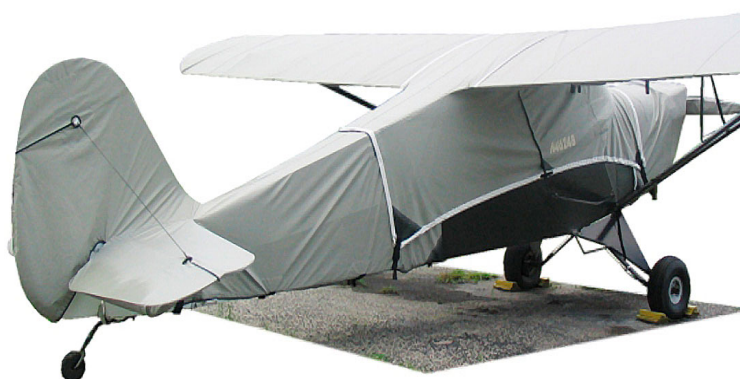
Taylorcraft L-2 Grasshopper Prop, Engine, Canopy, Wing and Empennage Covers