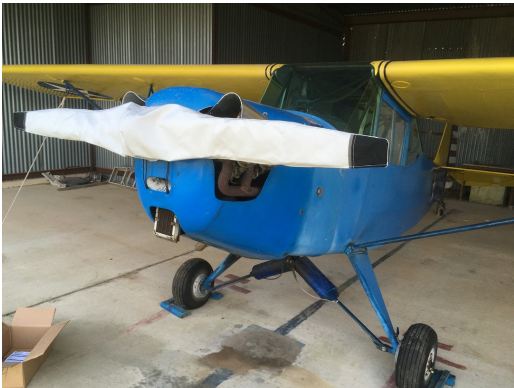
Taylorcraft L-2 Grasshopper Propellor/Spinner Cover