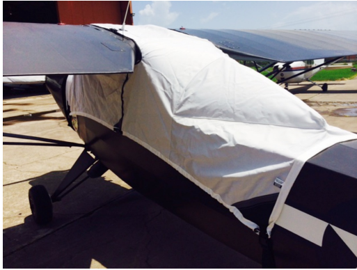
Taylorcraft L-2 Canopy Cover

This cover type is made from Silver Acrylic Sunbrella canvas and is 100% lined with a soft and smooth microfiber. Bruce's Custom Covers developed this material combination especially for aircraft protection. The outer material is medium weight and treated for water resistance, UV resistance and anti-static buildup. The inner lining is a very soft and smooth microfiber to prevent scratching. The material is very reflective, and tests show that the cabin interior temperature can be reduced to near-ambient temperature on the hottest of days. It is water, ice and snow repellent, yet breathable to allow moisture to escape from between the cover and the aircraft surface.