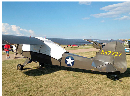
Taylorcraft L-2 Canopy Cover

This cover type is made from Silver Acrylic Sunbrella canvas and is 100% lined with a soft and smooth microfiber. Bruce's Custom Covers developed this material combination especially for aircraft protection. The outer material is medium weight and treated for water resistance, UV resistance and anti-static buildup. The inner lining is a very soft and smooth microfiber to prevent scratching. The material is very reflective, and tests show that the cabin interior temperature can be reduced to near-ambient temperature on the hottest of days. It is water, ice and snow repellent, yet breathable to allow moisture to escape from between the cover and the aircraft surface.