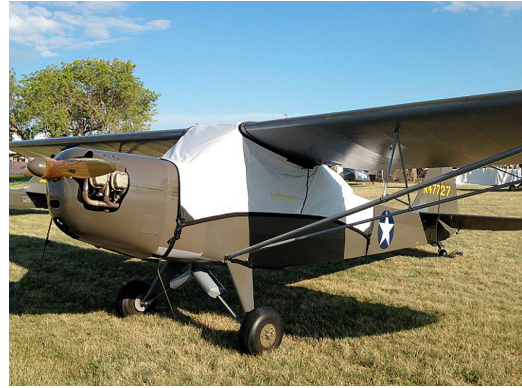
Taylorcraft L-2 Canopy Cover