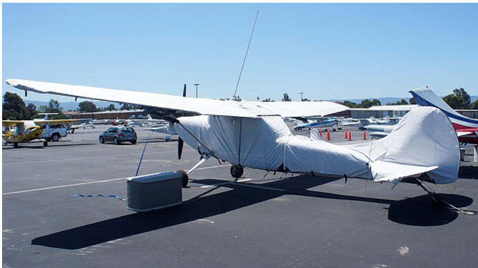
Cessna L-19 Extended Over-the-top Canopy, Engine, Empennage & Wing Covers

WINTER USE MATERIAL - Made with Solution-Dyed Polyester fabric, this option is intended for seasonal use to aid in deicing, rain mitigation, or for occasional travel. The material is lighter and more compact, but more susceptible to UV damage and may have a shorter useful life if used continuously outside than the all-year use material.