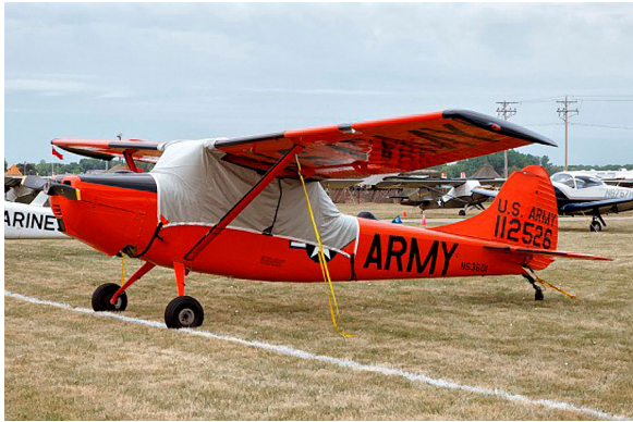
Cessna L-19 Bird Dog Canopy Cover

The material is very reflective, and tests show that the cabin interior temperature can be reduced to near-ambient temperature on the hottest of days. It is water, ice and snow repellent, yet breathable to allow moisture to escape from between the cover and the aircraft surface.