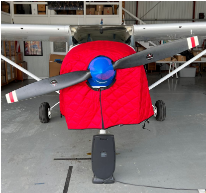
Insulated Hangar Blanket on Cessna 182

This cover type is made from Silver Acrylic Sunbrella canvas and is 100% lined with a soft and smooth microfiber. Bruce's Custom Covers developed this material combination especially for aircraft protection. The outer material is medium weight and treated for water resistance, UV resistance and anti-static buildup. The inner lining is a very soft and smooth microfiber to prevent scratching. The material is very reflective, and tests show that the cabin interior temperature can be reduced to near-ambient temperature on the hottest of days. It is water, ice and snow repellent, yet breathable to allow moisture to escape from between the cover and the aircraft surface.