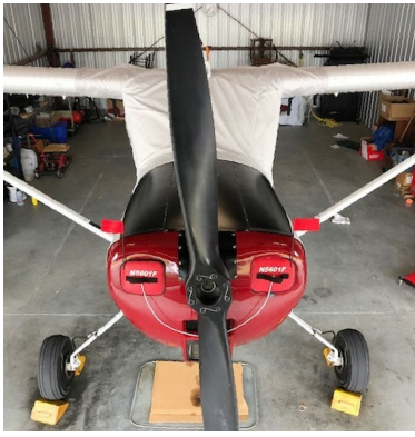
Cessna Bird Dog, L-19, O-1, 305 Engine Inlet Plugs