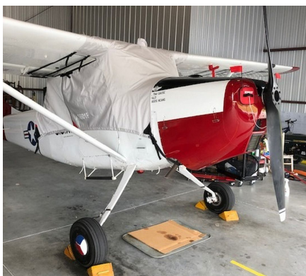
Cessna Bird Dog, L-19, O-1, 305 Canopy Cover, Over-Top Type