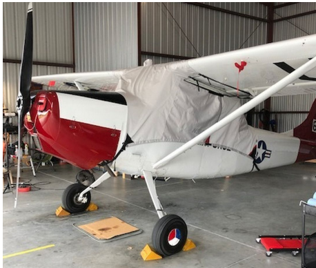
Cessna Bird Dog, L-19, O-1, 305 Canopy Cover, Over-Top Type