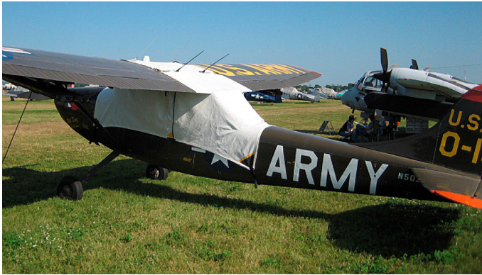
L-19 Canopy Cover