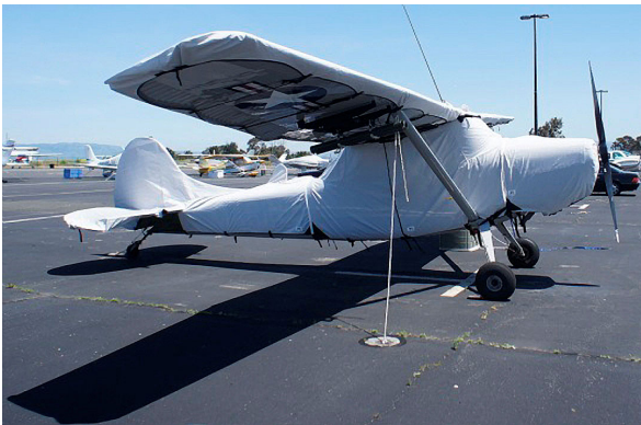
Wing Covers on Cessna Bird Dog