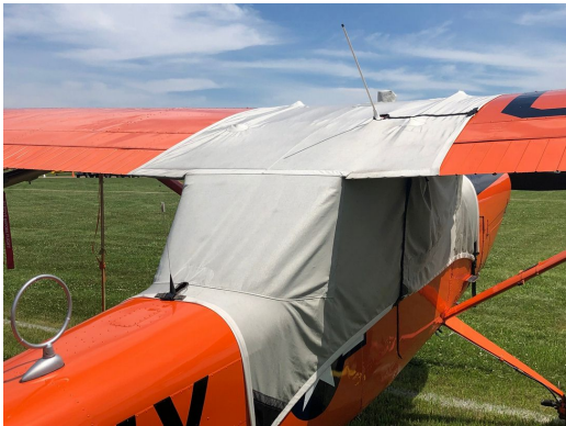
Cessna L-19 Bird Dog Over-Top Canopy Cover

This cover type is made from Silver Acrylic Sunbrella canvas and is 100% lined with a soft and smooth microfiber. Bruce's Custom Covers developed this material combination especially for aircraft protection. The outer material is medium weight and treated for water resistance, UV resistance and anti-static buildup. The inner lining is a very soft and smooth microfiber to prevent scratching. The material is very reflective, and tests show that the cabin interior temperature can be reduced to near-ambient temperature on the hottest of days. It is water, ice and snow repellent, yet breathable to allow moisture to escape from between the cover and the aircraft surface.