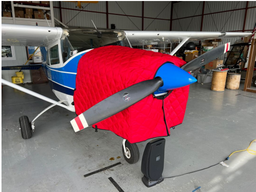
Insulated Hangar Blanket on Cessna 182