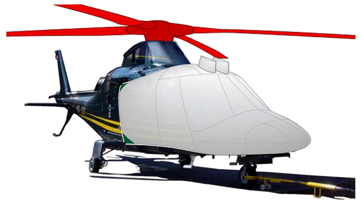
Agusta 109 Bubble, Rotor Hub & Blade Covers (illustration)