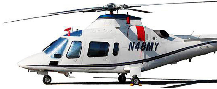
Agusta Power Pitot Covers, Intake Covers, and Cockpit Heatshield set