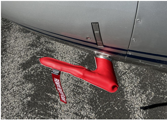
Agusta AW109 (A, C, & Trekker) Pitot Cover Set