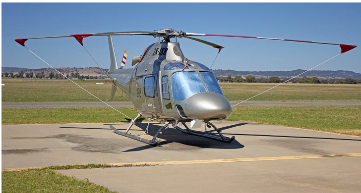
Agusta 119 Cockpit/Cabin HeatShields

Cabin Heatshields are interior sunshades for the aircraft's passenger cabin area. The product is a unique composite of closed-cell foam with a silver mylar finish. The semi-rigid design is stiff enough to stand inside the window framing. The set folds up flat and is easily stored in the included storage sleeve. Some designs may require velcro and suction cups. A Heatshield is an excellent short-term remedy for cockpit overheating, but an external fabric cover is more effective for long-term protection.