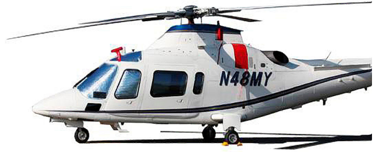
Agusta Power Pitot Covers, Intake Covers, and Cockpit Heatshield set