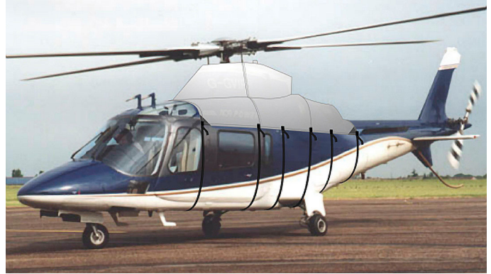
Agusta Power Engine Cover (illustration)