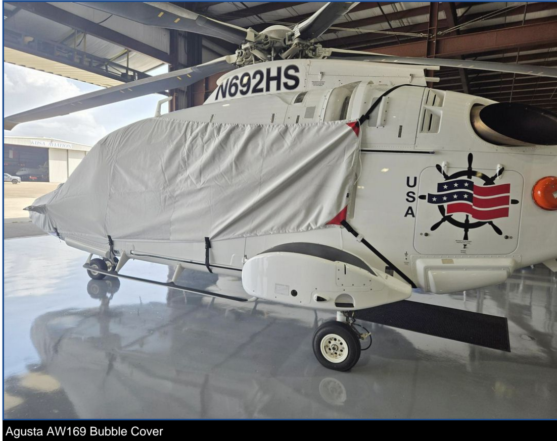
Agusta AW169 Bubble Cover