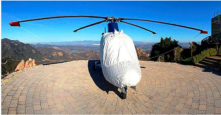
Agusta 109 Mk II+ Bubble Cover and Blade Tie-downs