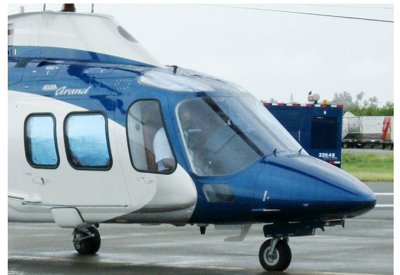
Agusta Grand Cabin & Skylight HeatShields