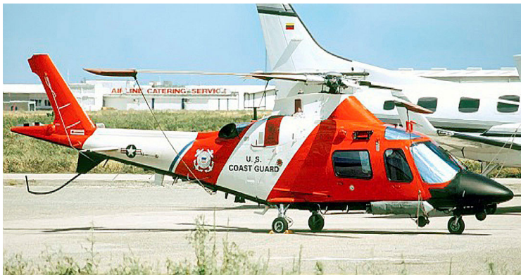
Covers, Plugs, HeatShields and related items for the Agusta MH-68A

Cabin Heatshields are interior sunshades for the aircraft's passenger cabin area. The product is a unique composite of closed-cell foam with a silver mylar finish. The semi-rigid design is stiff enough to stand inside the window framing. The set folds up flat and is easily stored in the included storage sleeve. Some designs may require velcro and suction cups. A Heatshield is an excellent short-term remedy for cockpit overheating, but an external fabric cover is more effective for long-term protection.