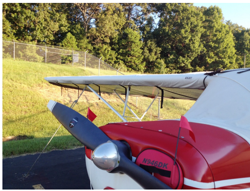
Aeronca Champ Engine Plugs, Wing Covers