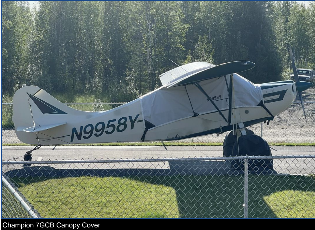
Champion 7GCB Canopy Cover