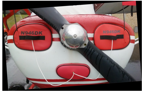
Aeronca Champ Engine Plugs