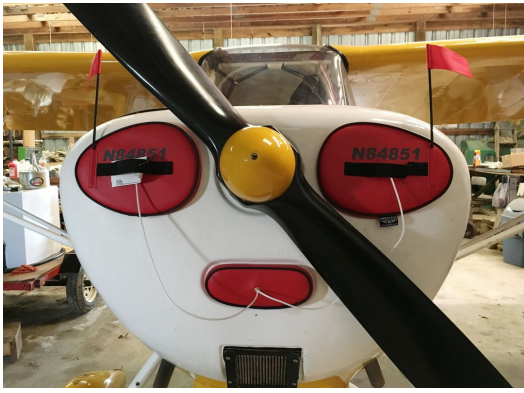
Aeronca 7AC Engine Inlet Plugs