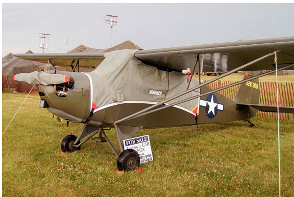
Aeronca 7AC Champ Canopy & Prop Covers

This cover type is made from Silver Acrylic Sunbrella canvas and is 100% lined with a soft and smooth microfiber. Bruce's Custom Covers developed this material combination especially for aircraft protection. The outer material is medium weight and treated for water resistance, UV resistance and anti-static buildup. The inner lining is a very soft and smooth microfiber to prevent scratching. The material is very reflective, and tests show that the cabin interior temperature can be reduced to near-ambient temperature on the hottest of days. It is water, ice and snow repellent, yet breathable to allow moisture to escape from between the cover and the aircraft surface.