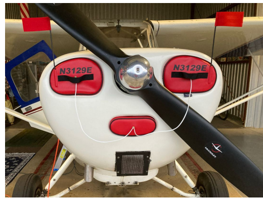
Aeronca Champ Engine Plugs