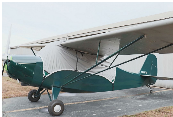
Aeronca 7AC Over-Top Canopy Cover, Light Weight Travel Type