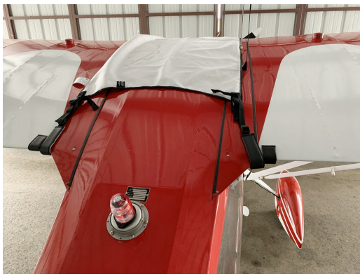
Bellanca Citabria Windshield/Skylight Cover