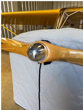
Aeronca 7AC Insulated Hangar Blanket, interior use

This cover type is made from Silver Acrylic Sunbrella canvas and is 100% lined with a soft and smooth microfiber. Bruce's Custom Covers developed this material combination especially for aircraft protection. The outer material is medium weight and treated for water resistance, UV resistance and anti-static buildup. The inner lining is a very soft and smooth microfiber to prevent scratching. The material is very reflective, and tests show that the cabin interior temperature can be reduced to near-ambient temperature on the hottest of days. It is water, ice and snow repellent, yet breathable to allow moisture to escape from between the cover and the aircraft surface.