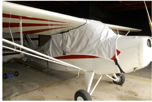
Aeronca 7AC Canopy Cover