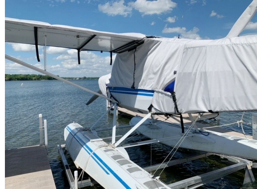
Aeronca 7GC Amphib Cover Set