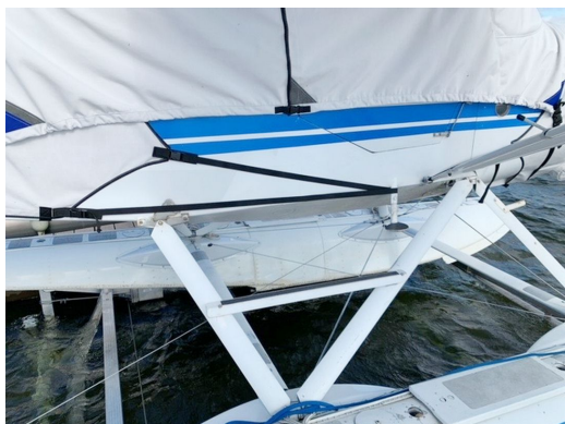
Aeronca 7GC Amphib Cover Set

WINTER USE MATERIAL - Made with Solution-Dyed Polyester fabric, this option is intended for seasonal use to aid in deicing, rain mitigation, or for occasional travel. The material is lighter and more compact, but more susceptible to UV damage and may have a shorter useful life if used continuously outside than the all-year use material.