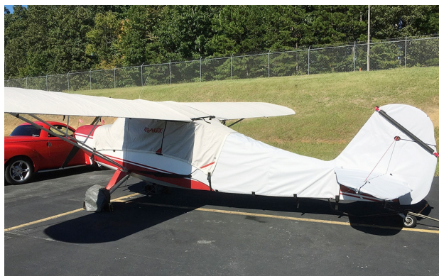
Aeronca Champ 7AC/7EC Wing and Empennage Covers