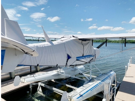
Aeronca 7GC Amphib Cover Set

This cover type is made from Silver Acrylic Sunbrella canvas and is 100% lined with a soft and smooth microfiber. Bruce's Custom Covers developed this material combination especially for aircraft protection. The outer material is medium weight and treated for water resistance, UV resistance and anti-static buildup. The inner lining is a very soft and smooth microfiber to prevent scratching. The material is very reflective, and tests show that the cabin interior temperature can be reduced to near-ambient temperature on the hottest of days. It is water, ice and snow repellent, yet breathable to allow moisture to escape from between the cover and the aircraft surface.