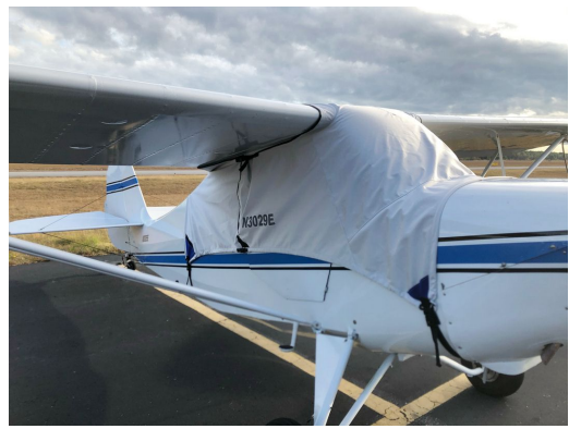
Aeronca 7AC Over The Top Style Canopy Cover