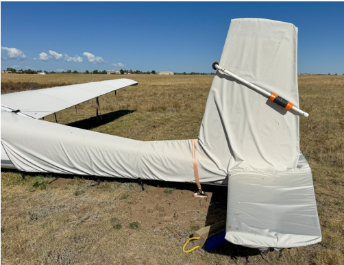
LET L-13 Empennage Cover