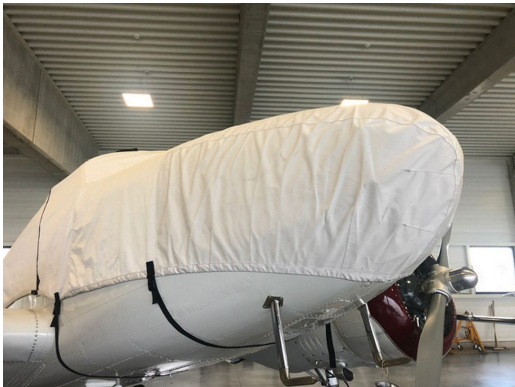
Lockheed 12 Canopy/Nose Cover

This cover type is made from Silver Acrylic Sunbrella canvas and is 100% lined with a soft and smooth microfiber. Bruce's Custom Covers developed this material combination especially for aircraft protection. The outer material is medium weight and treated for water resistance, UV resistance and anti-static buildup. The inner lining is a very soft and smooth microfiber to prevent scratching. The material is very reflective, and tests show that the cabin interior temperature can be reduced to near-ambient temperature on the hottest of days. It is water, ice and snow repellent, yet breathable to allow moisture to escape from between the cover and the aircraft surface.