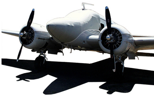
Beech 18 Cockpit/Nose Cover

This cover type is made from Silver Acrylic Sunbrella canvas and is 100% lined with a soft and smooth microfiber. Bruce's Custom Covers developed this material combination especially for aircraft protection. The outer material is medium weight and treated for water resistance, UV resistance and anti-static buildup. The inner lining is a very soft and smooth microfiber to prevent scratching. The material is very reflective, and tests show that the cabin interior temperature can be reduced to near-ambient temperature on the hottest of days. It is water, ice and snow repellent, yet breathable to allow moisture to escape from between the cover and the aircraft surface.