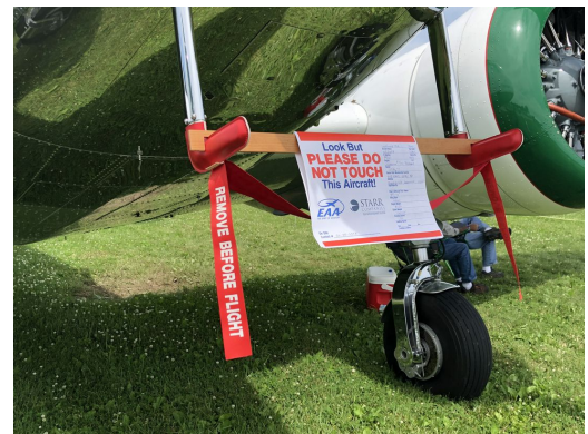
Lockheed 12 Pitot Covers