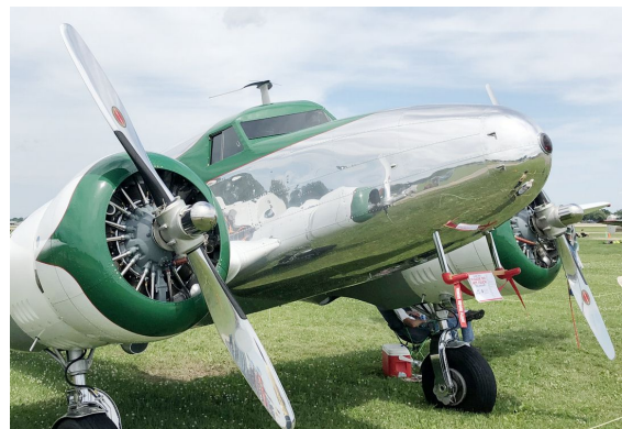
Lockheed 12 Pitot Covers