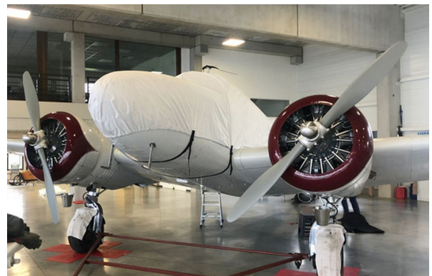
Lockheed 12 Canopy/Nose Cover