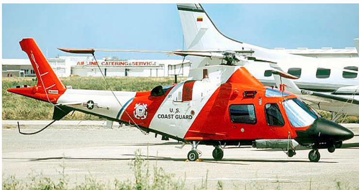
Covers, Plugs, HeatShields and related items for the Agusta MH-68A

Cabin Heatshields are interior sunshades for the aircraft's passenger cabin area. The product is a unique composite of closed-cell foam with a silver mylar finish. The semi-rigid design is stiff enough to stand inside the window framing. The set folds up flat and is easily stored in the included storage sleeve. Some designs may require velcro and suction cups. A Heatshield is an excellent short-term remedy for cockpit overheating, but an external fabric cover is more effective for long-term protection.