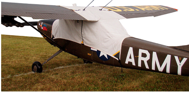
L-19 Canopy Cover

water resistance, UV resistance and anti-static buildup. The inner lining is a very soft and smooth microfiber to prevent scratching. The material is very reflective, and tests show that the cabin interior temperature can be reduced to near-ambient temperature on the hottest of days. It is water, ice and snow repellent, yet breathable to allow moisture to escape from between the cover and the aircraft surface.