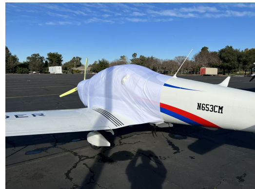
Jihlavan JA-600 Skyleader Extended Canopy/Engine Cover, test fit cover