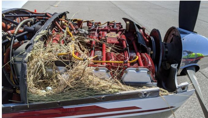
ENGINE PLUGS PREVENT BIRD NEST FOD. Piper Saratoga Engine Cowling Bird's Nest

necessary. Engine plugs have warning flags that are visible from the cockpit or 'remove before flight' streamers sewn onto the face of the plugs. Most plugs are imprinted with the aircraft registration number in black for an extra charge. Storage bag NOT included. Engine plugs may be inserted after flight when the engine is still warm. Engine Inlet Plugs are commonly referred to as Cowl Plugs, Intake Plugs, Cowl Blocks, Engine Blocks, and Engine Bungs.