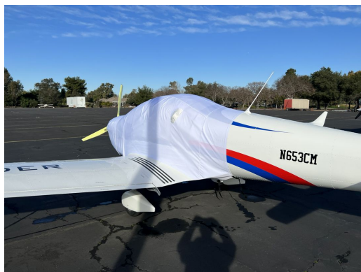
Jihlavan JA-600 Skyleader Extended Canopy/Engine Cover, test fit cover

This cover type is made from Silver Acrylic Sunbrella canvas and is 100% lined with a soft and smooth microfiber. Bruce's Custom Covers developed this material combination especially for aircraft protection. The outer material is medium weight and treated for water resistance, UV resistance and anti-static buildup. The inner lining is a very soft and smooth microfiber to prevent scratching. The material is very reflective, and tests show that the cabin interior temperature can be reduced to near-ambient temperature on the hottest of days. It is water, ice and snow repellent, yet breathable to allow moisture to escape from between the cover and the aircraft surface.