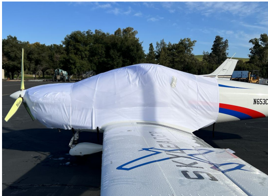
Jihlavan JA-600 Skyleader Extended Canopy/Engine Cover, test fit cover

This cover type is made from Silver Acrylic Sunbrella canvas and is 100% lined with a soft and smooth microfiber. Bruce's Custom Covers developed this material combination especially for aircraft protection. The outer material is medium weight and treated for water resistance, UV resistance and anti-static buildup. The inner lining is a very soft and smooth microfiber to prevent scratching. The material is very reflective, and tests show that the cabin interior temperature can be reduced to near-ambient temperature on the hottest of days. It is water, ice and snow repellent, yet breathable to allow moisture to escape from between the cover and the aircraft surface.