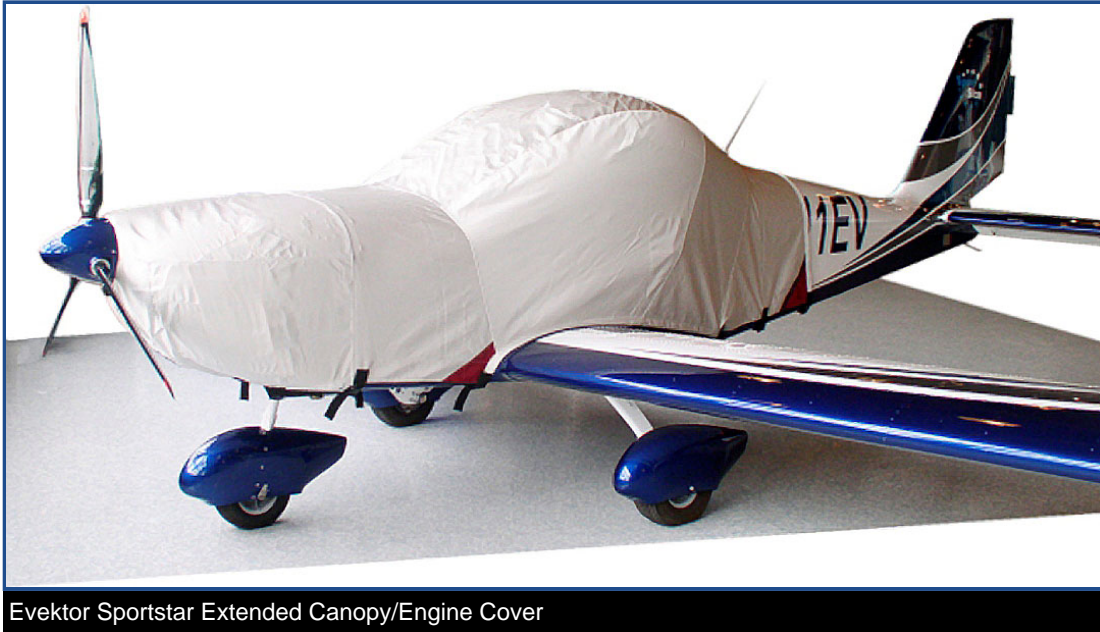
Evektor Sportstar Extended Canopy/Engine Cover