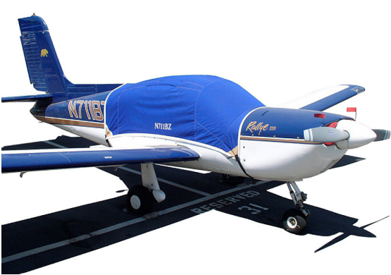
Rallye Canopy Cover

Travel Covers are made with Silver Solution-Dyed Polyester fabric and only lined over the windshield to save weight. The material is lightweight and more compact for easy stowage in the aircraft. The polyester material is water resistant, but only intended for occasional use outside. We also have an ultra lightweight material available for fitted hangar dust covers. For daily outdoor use, the non-travel Sunbrella Cover is the best choice.