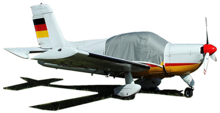
Rallye 150 Canopy Cover