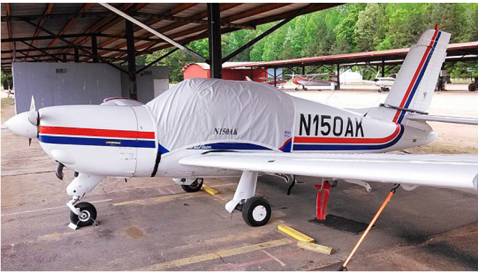
Rallye Canopy Cover