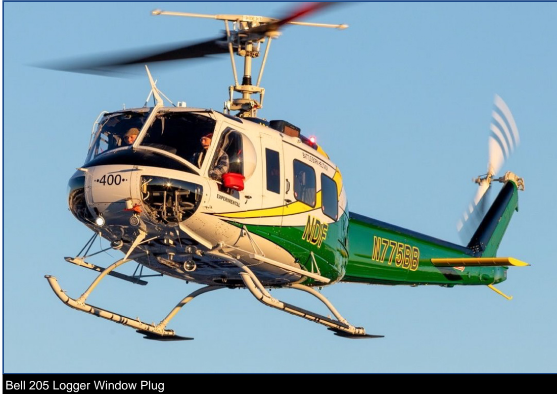
Bell 205 Logger Window Plug