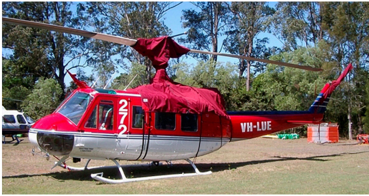
Bell 204/205 Engine/Mid-Cabin Cover, Main & Tail Rotor Covers