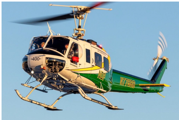
Bell 205 Logger Window Plug

The Engine Inlet Plugs are custom fit for your Kaman KMAX intakes, made with heavy-duty vinyl material, and stuffed with a single block of sculpted urethane foam. Each plug has a zipper that allows the foam to be removed and dried if necessary. Engine plugs have 'Remove Before Flight' streamers sewn onto the face of the plugs. Most plugs are imprinted with the aircraft registration number in black for an extra charge. Storage bag NOT included. Engine plugs may be inserted after flight when the engine is still warm. Engine Inlet Plugs are commonly referred to as Cowl Plugs, Intake Plugs, Cowl Blocks, Engine Blocks, and Engine Bungs.