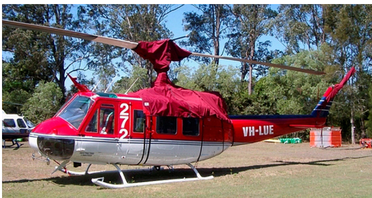
Bell 204/205 Engine/Mid-Cabin Cover, Main & Tail Rotor Covers