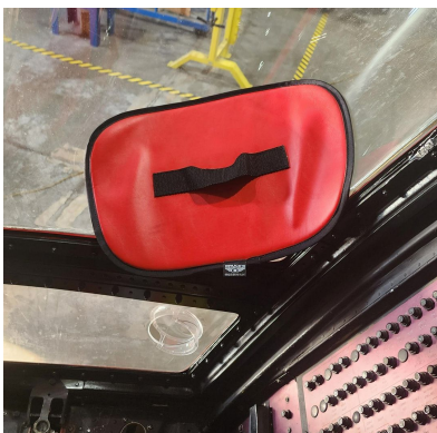
Boeing Vertol CH-47 Logger Window Plug

The Engine Inlet Plugs are custom fit for your Kaman KMAX intakes, made with heavy-duty vinyl material, and stuffed with a single block of sculpted urethane foam. Each plug has a zipper that allows the foam to be removed and dried if necessary. Engine plugs have 'Remove Before Flight' streamers sewn onto the face of the plugs. Most plugs are imprinted with the aircraft registration number in black for an extra charge. Storage bag NOT included. Engine plugs may be inserted after flight when the engine is still warm. Engine Inlet Plugs are commonly referred to as Cowl Plugs, Intake Plugs, Cowl Blocks, Engine Blocks, and Engine Bungs.