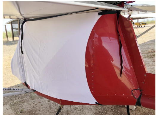
Rans S-12 Airaile Canopy/Nose Cover (test fit cover)