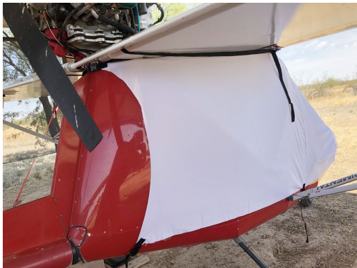
Rans S-12 Airaile Canopy/Nose Cover (test fit cover)

Travel Covers are made with Silver Solution-Dyed Polyester fabric and only lined over the windshield to save weight. The material is lightweight and more compact for easy stowage in the aircraft. The polyester material is water resistant, but only intended for occasional use outside. We also have an ultra lightweight material available for fitted hangar dust covers. For daily outdoor use, the non-travel Sunbrella Cover is the best choice.