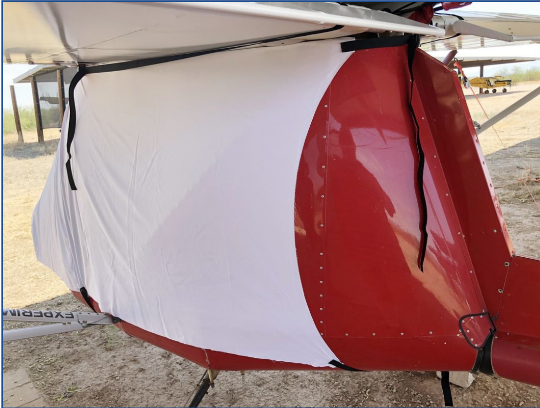
Rans S-12 Airaile Canopy/Nose Cover (test fit cover)