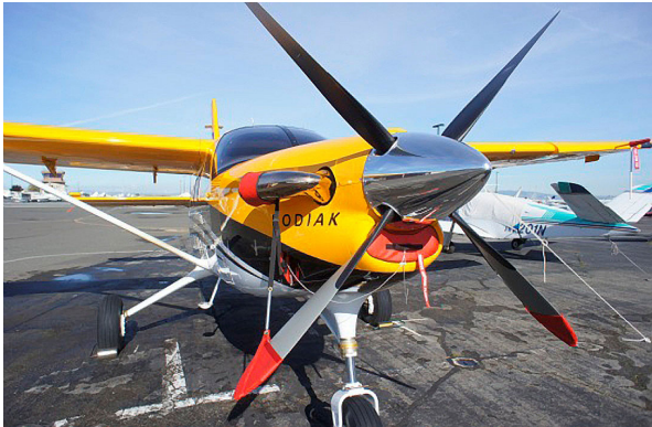
Quest Kodiak Prop Tie/Exhaust Covers, Engine Inlet Plugs & Pitot Covers