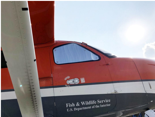
Quest Kodiak Cockpit HeatShields