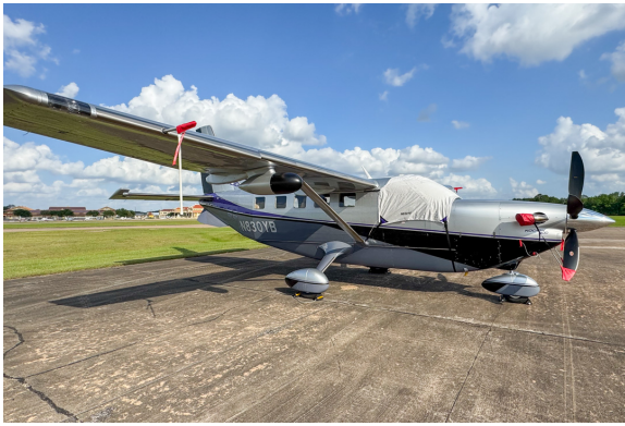
Kodiak 200 Cockpit Cover, Pitot Cover, Prop Tie/Exhaust Cover