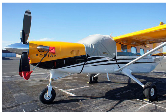
Quest Kodiak Cockpit Cover, Engine Plugs, Prop Tie/Exhaust Covers, & Cabin HeatShields set