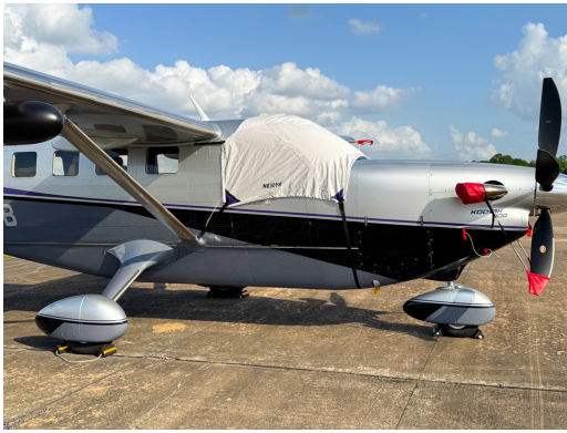
Kodiak Aircraft Co Inc KODIAK 200 Cockpit Cover