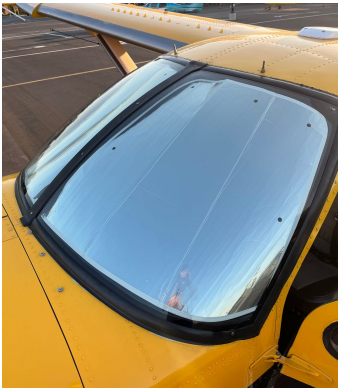
Quest Kodiak Windshield HeatShields

Cockpit Heatshields are interior sunshades for the aircraft's cockpit. The product is a unique composite of closed-cell foam with a silver mylar finish. The semi-rigid design is stiff enough to stand inside the window framing. The set folds up flat and is easily stored in the included storage sleeve. Some designs may require velcro and suction cups. A Heatshield is an excellent short-term remedy for cockpit overheating, but an external fabric cover is more effective for long-term protection.