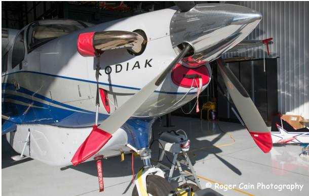
Quest Kodiak Engine Plugs, Prop Tie-Down & Exhaust Covers

water resistance, UV resistance and anti-static buildup. The inner lining is a very soft and smooth microfiber to prevent scratching. The material is very reflective, and tests show that the cabin interior temperature can be reduced to near-ambient temperature on the hottest of days. It is water, ice and snow repellent, yet breathable to allow moisture to escape from between the cover and the aircraft surface.