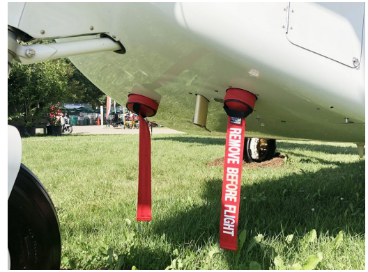
Quest Kodiak Lower Cowling Bypass Duct Plugs