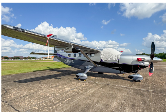
Kodiak 200 Cockpit Cover, Pitot Cover, Prop Tie/Exhaust Cover

This cover type is made from Silver Acrylic Sunbrella canvas and is 100% lined with a soft and smooth microfiber. Bruce's Custom Covers developed this material combination especially for aircraft protection. The outer material is medium weight and treated for water resistance, UV resistance and anti-static buildup. The inner lining is a very soft and smooth microfiber to prevent scratching. The material is very reflective, and tests show that the cabin interior temperature can be reduced to near-ambient temperature on the hottest of days. It is water, ice and snow repellent, yet breathable to allow moisture to escape from between the cover and the aircraft surface.