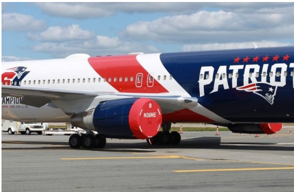
Boeing 767 Intake Covers