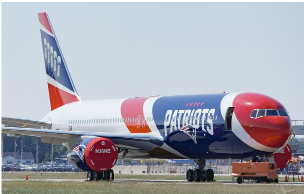
Boeing 767 Intake Covers