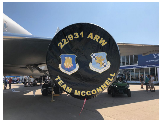
Boeing KC-46 Intake Cover