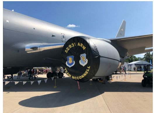
Boeing KC-46 Intake Cover