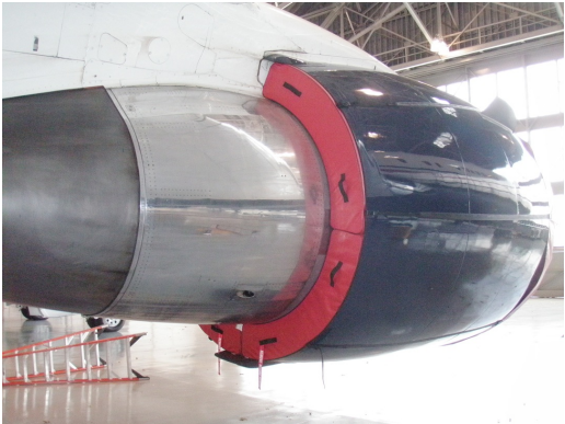
Boeing 767 Exhaust Plugs Ship Set, incl. Fan Thrust Reverser and Exhaust Plugs P/N: B767-200