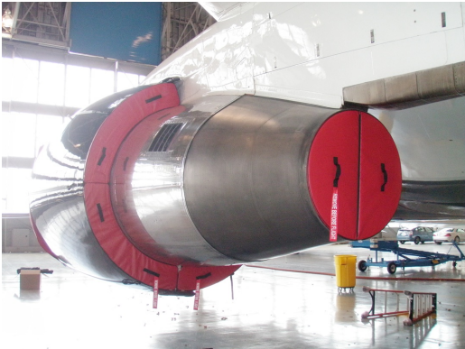
Exhaust Plugs Ship Set, incl. Fan Thrust Reverser and Exhaust Plugs P/N: B767-200

The Engine Inlet Plugs are custom fit for your Boeing KC-46, KC-46A, Pegasus intakes, made with heavy-duty vinyl material, and stuffed with a single block of sculpted urethane foam. Each plug has a zipper that allows the foam to be removed and dried if necessary. Engine plugs have 'remove before flight' streamers sewn onto the face of the plugs. Most plugs are imprinted with the aircraft registration number in black for an extra charge. Storage bag NOT included. Engine plugs may be inserted after flight when the engine is still warm. Engine Inlet Plugs are commonly referred to as Cowl Plugs, Intake Plugs, Cowl Blocks, Engine Blocks, and Engine Bungs.