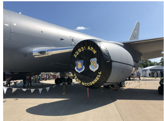
Boeing KC-46 Intake Cover