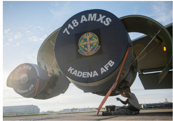
KC-135 Tamborine Style Intake Covers