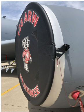
Boeing KC-135 Intake Covers, Tamborine Type

The Boeing KC-135, C-135, RC-135, EC-135 Intake Covers are designed to install easily yet be completely storable. A spring steel hoop is sewn into the hem of each cover, allowing them to be installed without climbing onto the wing or using a stepladder. To store the covers the spring steel hoop folds like a band-saw blade into three nesting rings. Each cover folds into a compact circular bundle which is stored in the included duffle bag, yet they unfold quickly for use. The Tri-Fold Ring cover is made of medium weight nylon which is available in a variety of colors to match the paint trim. Each cover set comes complete with installation and folding instructions. The aircraft's registration number can be silkscreened onto the cover for an extra charge.