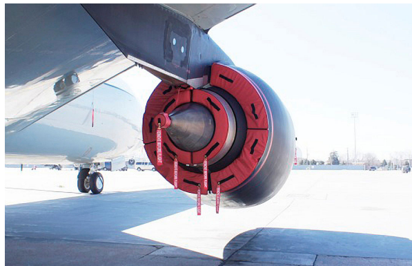
RC-135W Bypass Vent and Exhaust Plugs