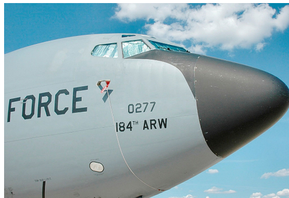
KC-135 Cockpit HeatShields

Cockpit Heatshields are interior sunshades for the aircraft's cockpit. The product is a unique composite of closed-cell foam with a silver mylar finish. The semi-rigid design is stiff enough to stand inside the window framing. The set folds up flat and is easily stored in the included storage sleeve. Some designs may require velcro and suction cups. Our Heatshields for jets are offered white side out because some aircraft manufacturers have issued advisories against reflective window inserts due to potential heat damage. A Heatshield is an excellent short-term remedy for cockpit overheating, but an external fabric cover is more effective for long-term protection.