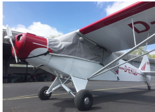
Piper Super Cub Travel Weight Canopy Cover