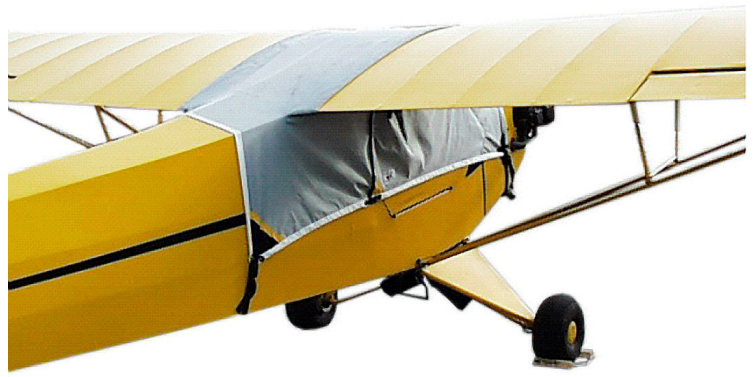
Piper J3 Over-Top Canopy Cover