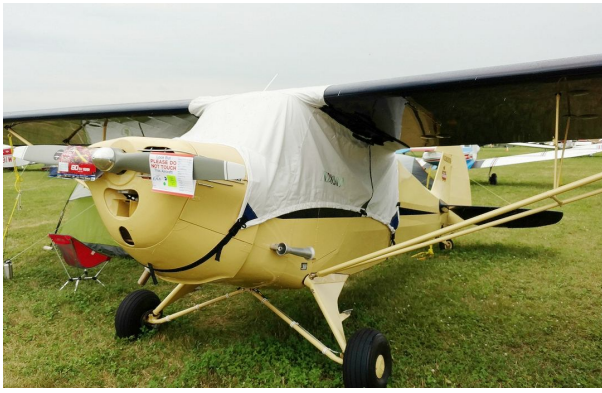
Piper J-4 Cub Coupe Canopy Cover (Over-Top)