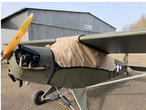
Piper L-4 models Canopy Cover, Over Top Type

This cover type is made from Silver Acrylic Sunbrella canvas and is 100% lined with a soft and smooth microfiber. Bruce's Custom Covers developed this material combination especially for aircraft protection. The outer material is medium weight and treated for water resistance, UV resistance and anti-static buildup. The inner lining is a very soft and smooth microfiber to prevent scratching. The material is very reflective, and tests show that the cabin interior temperature can be reduced to near-ambient temperature on the hottest of days. It is water, ice and snow repellent, yet breathable to allow moisture to escape from between the cover and the aircraft surface.