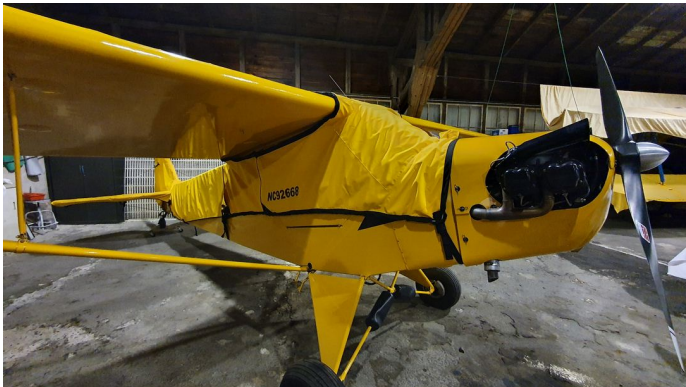
Piper PA-18 Super Cub Canopy Cover (Over-The-Top Style) Piper J3 Over The Top Style Canopy Cover & Empennage Cover