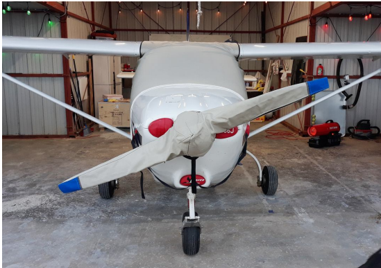
Jabiru J250 Canopy & Prop Cover