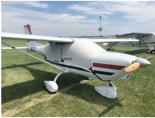
Jabiru J250 Canopy Cover