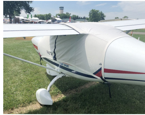
Jabiru J250 Canopy Cover