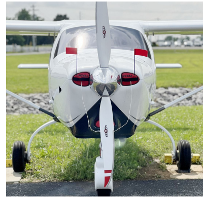
Jabiru J230-SP Engine Inlet Plugs