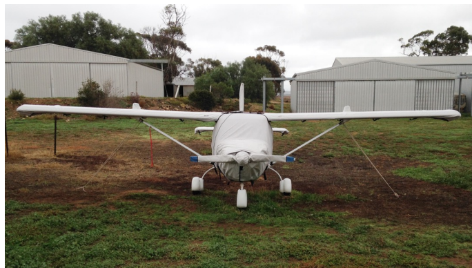
Jabiru 160 Canopy, Engine, Prop, Wings & Empennage Covers