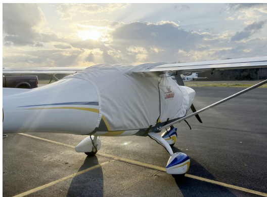
Jabiru J230-SP Extended Canopy Cover

This cover type is made from Silver Acrylic Sunbrella canvas and is 100% lined with a soft and smooth microfiber. Bruce's Custom Covers developed this material combination especially for aircraft protection. The outer material is medium weight and treated for water resistance, UV resistance and anti-static buildup. The inner lining is a very soft and smooth microfiber to prevent scratching. The material is very reflective, and tests show that the cabin interior temperature can be reduced to near-ambient temperature on the hottest of days. It is water, ice and snow repellent, yet breathable to allow moisture to escape from between the cover and the aircraft surface.