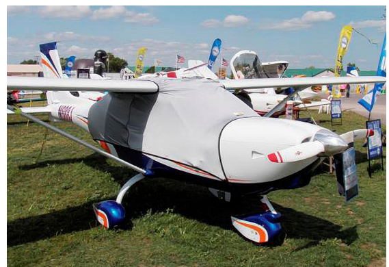
Jabiru Spandex FlyAway Travel Canopy Cover