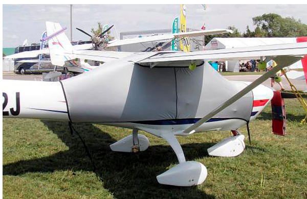
Jabiru Spandex FlyAway Travel Canopy Cover

Travel Covers are made with Silver Solution-Dyed Polyester fabric and only lined over the windshield to save weight. The material is lightweight and more compact for easy stowage in the aircraft. The polyester material is water resistant, but only intended for occasional use outside. We also have an ultra lightweight material available for fitted hangar dust covers. For daily outdoor use, the non-travel Sunbrella Cover is the best choice.