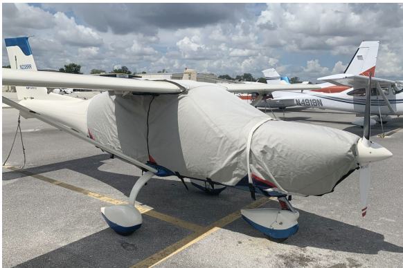
Jabiru 230D Extended Canopy Cover & Engine Covers