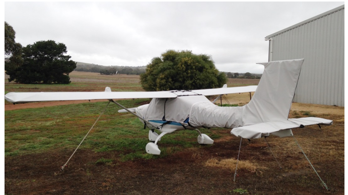
Jabiru 160 Canopy, Engine, Prop, Wings & Empennage Covers Jabiru 160 Canopy, Engine, Prop, Wings & Empennage Covers