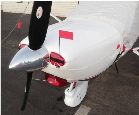
Jabiru 430 Engine Inlet Plugs