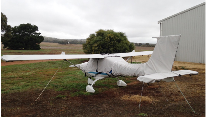
Jabiru 160 Canopy, Engine, Prop, Wings & Empennage Covers Jabiru 160 Canopy, Engine, Prop, Wings & Empennage Covers