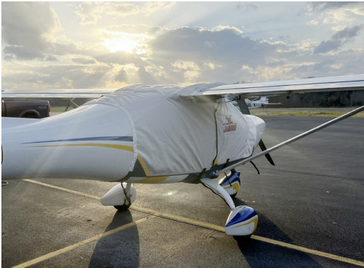
Jabiru J230-SP Extended Canopy Cover

This cover type is made from Silver Acrylic Sunbrella canvas and is 100% lined with a soft and smooth microfiber. Bruce's Custom Covers developed this material combination especially for aircraft protection. The outer material is medium weight and treated for water resistance, UV resistance and anti-static buildup. The inner lining is a very soft and smooth microfiber to prevent scratching. The material is very reflective, and tests show that the cabin interior temperature can be reduced to near-ambient temperature on the hottest of days. It is water, ice and snow repellent, yet breathable to allow moisture to escape from between the cover and the aircraft surface.