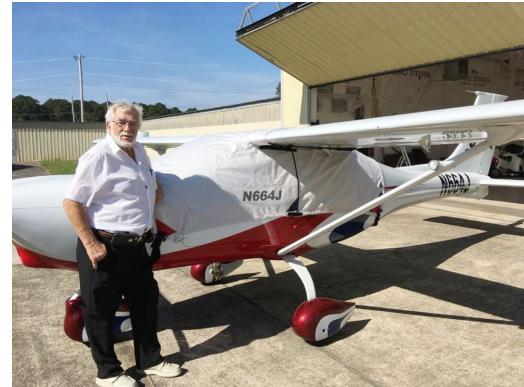
Jabiru 230SP Canopy Cover, Over-Top Style