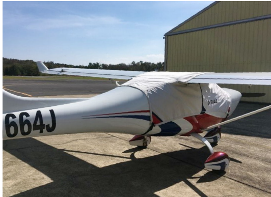
Jabiru J230-SP Canopy Cover, Over-Top Style

This cover type is made from Silver Acrylic Sunbrella canvas and is 100% lined with a soft and smooth microfiber. Bruce's Custom Covers developed this material combination especially for aircraft protection. The outer material is medium weight and treated for water resistance, UV resistance and anti-static buildup. The inner lining is a very soft and smooth microfiber to prevent scratching. The material is very reflective, and tests show that the cabin interior temperature can be reduced to near-ambient temperature on the hottest of days. It is water, ice and snow repellent, yet breathable to allow moisture to escape from between the cover and the aircraft surface.