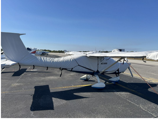
Jabiru 230D Complete Cover Set

WINTER USE MATERIAL - Made with Solution-Dyed Polyester fabric, this option is intended for seasonal use to aid in deicing, rain mitigation, or for occasional travel. The material is lighter and more compact, but more susceptible to UV damage and may have a shorter useful life if used continuously outside than the all-year use material.