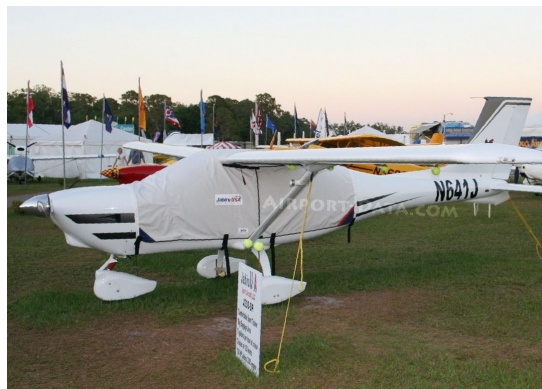
Jabiru J230 Canopy Cover