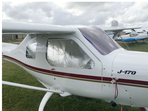
Jabiru 170 Heatshield Set

Heatshields are interior sunshades for an aircraft's windows or canopy glass. The product is a unique composite of closed-cell foam with a silver mylar finish. The semi-rigid design is stiff enough to stand along the inside of the windshield using sun visors or window framing. It folds up flat and easily stores in the included storage sleeve. Some designs may require velcro and suction cups. A Heatshield is an excellent short-term remedy for cockpit overheating.