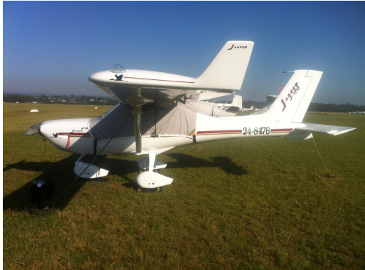
Jabiru 170 Canopy Cover