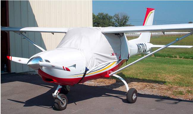
Jabiru 170 Canopy Cover

This cover type is made from Silver Acrylic Sunbrella canvas and is 100% lined with a soft and smooth microfiber. Bruce's Custom Covers developed this material combination especially for aircraft protection. The outer material is medium weight and treated for water resistance, UV resistance and anti-static buildup. The inner lining is a very soft and smooth microfiber to prevent scratching. The material is very reflective, and tests show that the cabin interior temperature can be reduced to near-ambient temperature on the hottest of days. It is water, ice and snow repellent, yet breathable to allow moisture to escape from between the cover and the aircraft surface.