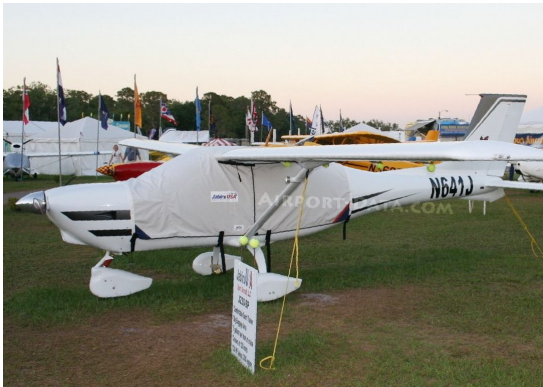
Jabiru J230 Canopy Cover