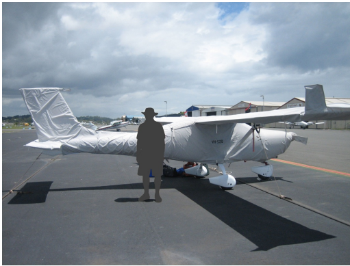
Jabiru J430 Complete Cover Set

This cover type is made from Silver Acrylic Sunbrella canvas and is 100% lined with a soft and smooth microfiber. Bruce's Custom Covers developed this material combination especially for aircraft protection. The outer material is medium weight and treated for water resistance, UV resistance and anti-static buildup. The inner lining is a very soft and smooth microfiber to prevent scratching. The material is very reflective, and tests show that the cabin interior temperature can be reduced to near-ambient temperature on the hottest of days. It is water, ice and snow repellent, yet breathable to allow moisture to escape from between the cover and the aircraft surface.