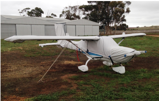
FOR INTERIOR USE. Cub Crafters CC-11 Insulated Hangar Blanket, available in Red or Silver Jabiru 160 Canopy, Engine, Prop, Wings & Empennage Covers