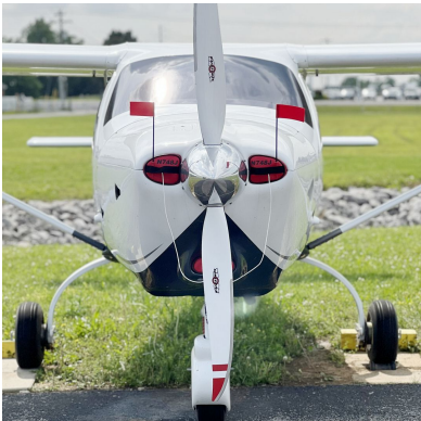
Jabiru J230-SP Engine Inlet Plugs