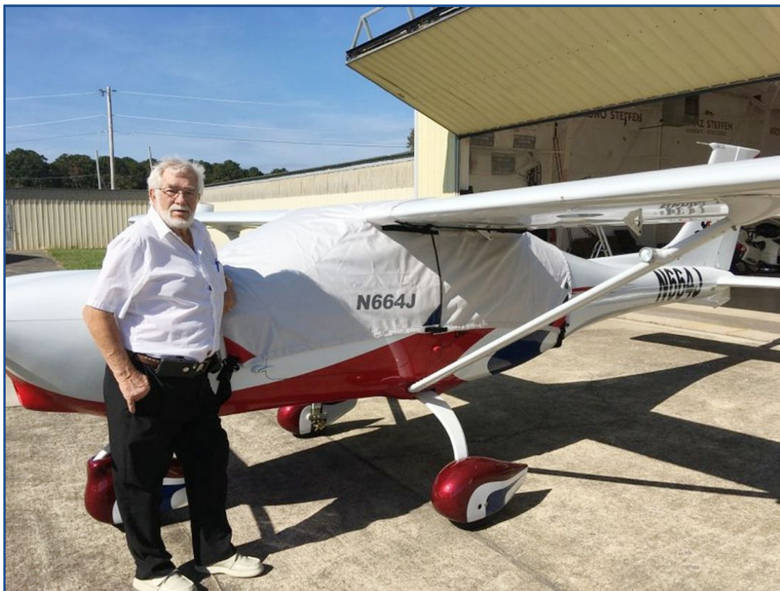
Jabiru 230SP Canopy Cover, Over-Top Style