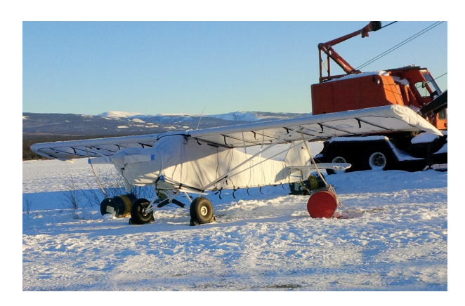
Piper Super Cub Complete Cover Set

ALL-YEAR USE MATERIAL - Made with Silver Acrylic Sunbrella canvas, the all-year use material is the best option for sun protection and cover longevity. This heavier more durable material is intended for all weather conditions, such as rain and snow or lots of sun.