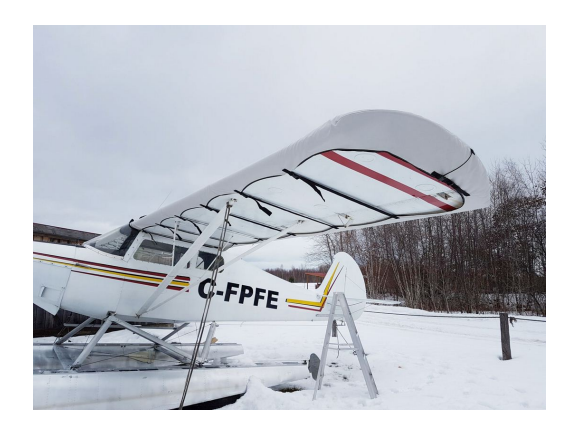
Christavia Mk 1 Wing Covers