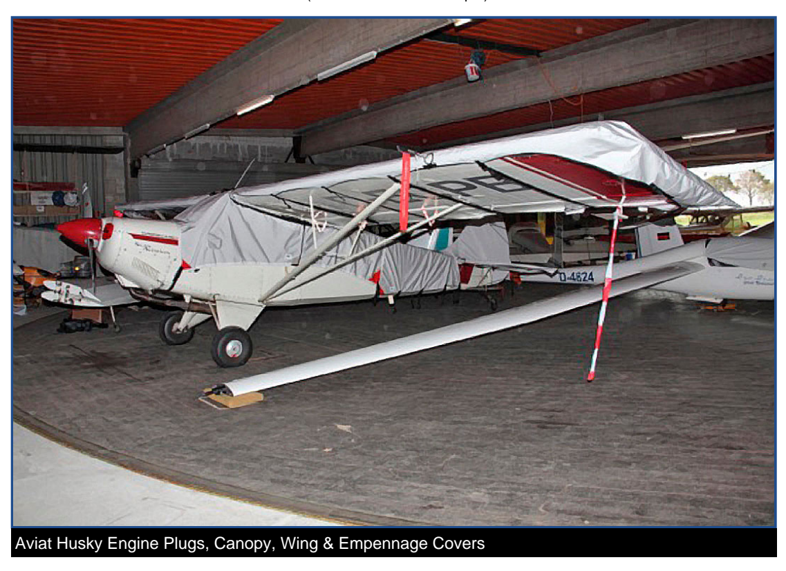
Section 1: Canopy/Cockpit/Fuselage Covers

Canopy Covers help reduce damage to your airplane's upholstery and avionics caused by excessive heat, and they can eliminate problems caused by leaking door and window seals. They keep the windshield and window surfaces clean and help prevent vandalism and theft.