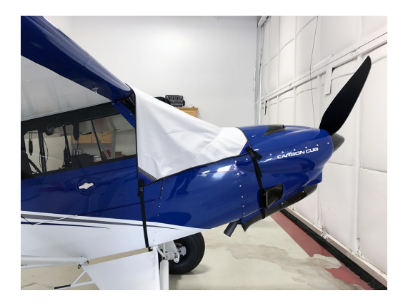
Cub Crafters CC-11 Windshield Cover