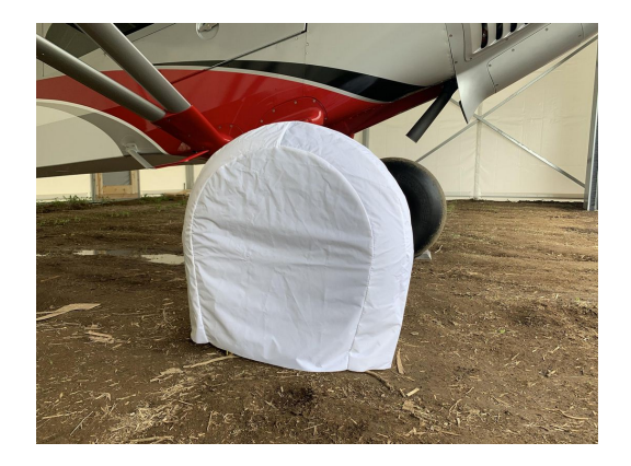
Cub Crafters CC19 Oversize Tire Covers, test fit cover