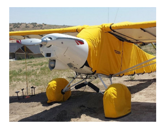
Piper PA-18 Super Cub Extended Canopy Cover, Wing & Tire Covers

WINTER USE MATERIAL - Made with Solution-Dyed Polyester fabric, this option is intended for seasonal use to aid in deicing, rain mitigation, or for occasional travel. The material is lighter and more compact, but more susceptible to UV damage and may have a shorter useful life if used continuously outside than the all-year use material.