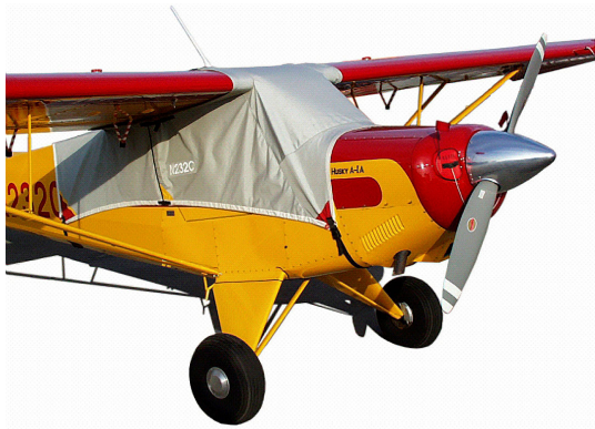
Aviat Husky Canopy Cover & Engine Plugs

Engine Inlet Plugs are custom fit for your Aviat (Christen) Husky intakes, made with heavy-duty vinyl material, and stuffed with a single block of sculpted urethane foam. Each plug has a zipper that allows the foam to be removed and dried if necessary. Engine plugs have warning flags that are visible from the cockpit or 'remove before flight' streamers sewn onto the face of the plugs. Most plugs are imprinted with the aircraft registration number in black for an extra charge. Storage bag NOT included. Engine plugs may be inserted after flight when the engine is still warm. Engine Inlet Plugs are commonly referred to as Cowl Plugs, Intake Plugs, Cowl Blocks, Engine Blocks, and Engine Bungs.