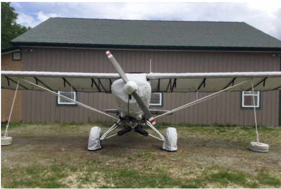
Aviat Husky Extended Canopy Cover, Engine, Prop, Empennage & Tire Covers Piper PA-18-150 Super Cub Complete Cover Set