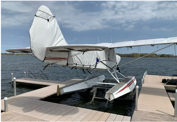
Aviat Husky Empennage Cover