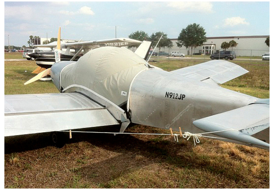
Zenith 601 XL Canopy Cover