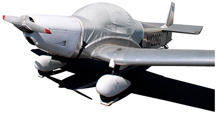
Zenith CH601 Canopy Cover & Prop Cover