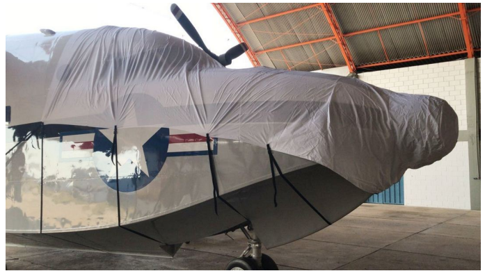
Grumman HU-16 Albatross Cockpit/Nose Cover (test fit cover)