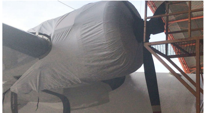
Grumman HU-16 Albatross Engine Cover (test fit cover)