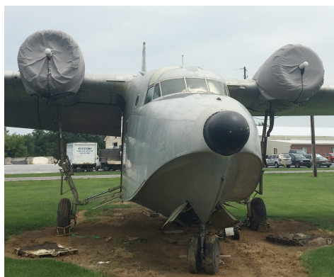
Grumman Albatross Engine Covers

This cover type is made from Silver Acrylic Sunbrella canvas and is 100% lined with a soft and smooth microfiber. Bruce's Custom Covers developed this material combination especially for aircraft protection. The outer material is medium weight and treated for water resistance, UV resistance and anti-static buildup. The inner lining is a very soft and smooth microfiber to prevent scratching. The material is very reflective, and tests show that the cabin interior temperature can be reduced to near-ambient temperature on the hottest of days. It is water, ice and snow repellent, yet breathable to allow moisture to escape from between the cover and the aircraft surface.