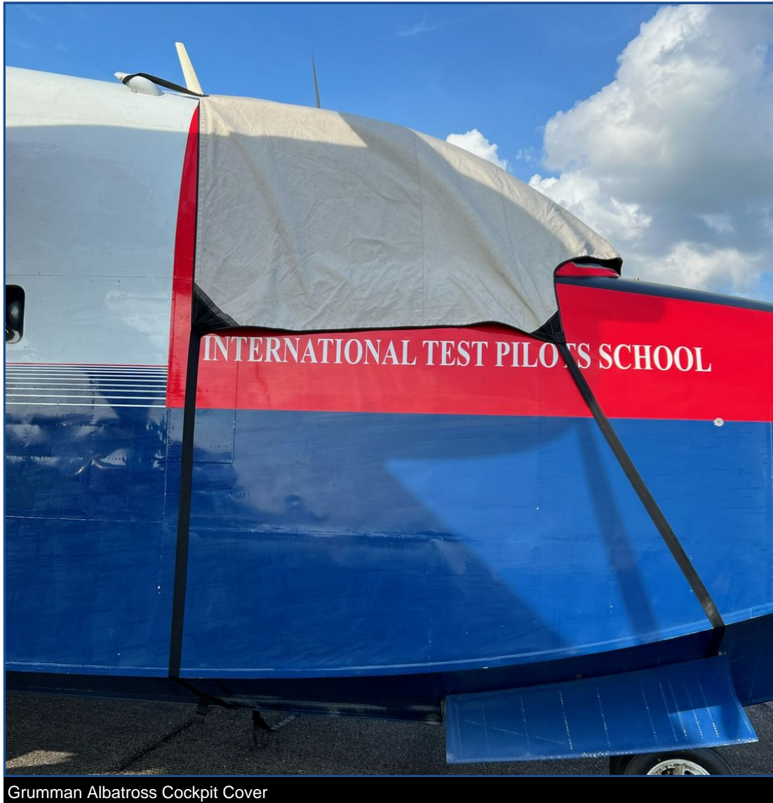
Grumman Albatross Cockpit Cover