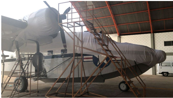
Grumman HU-16 Albatross Cockpit/Nose Cover and Engine Cover(test fit covers)

This cover type is made from Silver Acrylic Sunbrella canvas and is 100% lined with a soft and smooth microfiber. Bruce's Custom Covers developed this material combination especially for aircraft protection. The outer material is medium weight and treated for water resistance, UV resistance and anti-static buildup. The inner lining is a very soft and smooth microfiber to prevent scratching. The material is very reflective, and tests show that the cabin interior temperature can be reduced to near-ambient temperature on the hottest of days. It is water, ice and snow repellent, yet breathable to allow moisture to escape from between the cover and the aircraft surface.