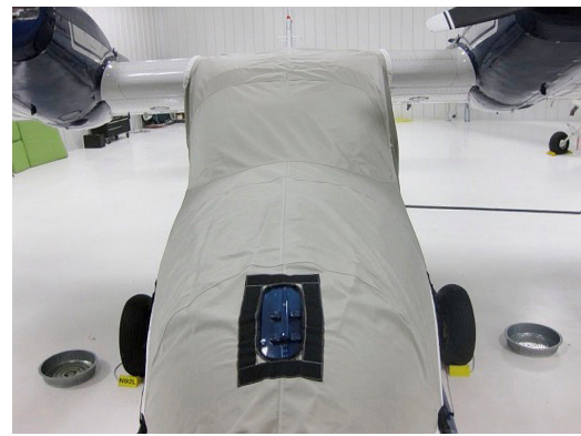
Grumman Widgeon Cockpit/Nose Cover, tie-down cleat detail