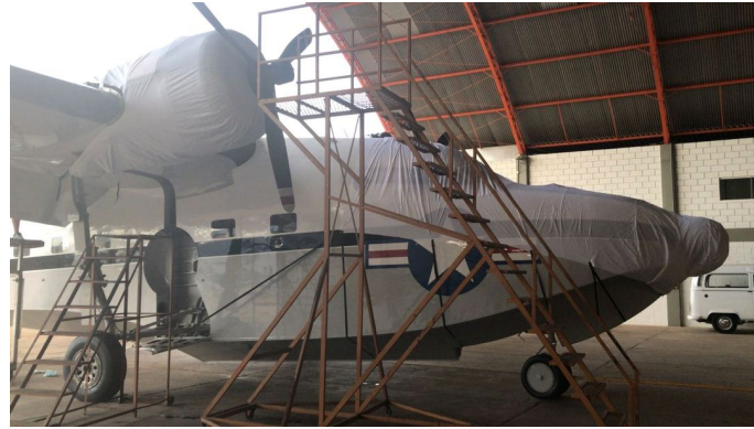
Grumman HU-16 Albatross Cockpit/Nose Cover and Engine Cover(test fit covers)