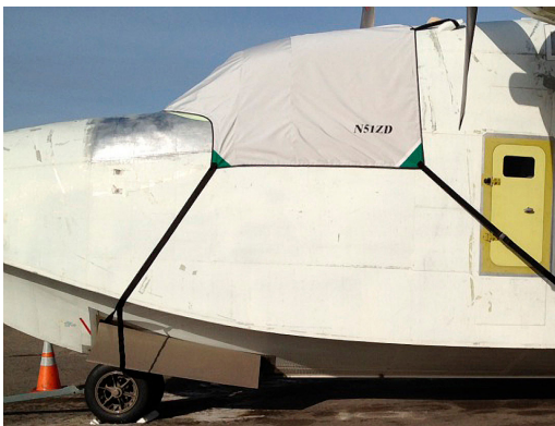
Grumman HU-16 Albatross Canopy Cover

This cover type is made from Silver Acrylic Sunbrella canvas and is 100% lined with a soft and smooth microfiber. Bruce's Custom Covers developed this material combination especially for aircraft protection. The outer material is medium weight and treated for water resistance, UV resistance and anti-static buildup. The inner lining is a very soft and smooth microfiber to prevent scratching. The material is very reflective, and tests show that the cabin interior temperature can be reduced to near-ambient temperature on the hottest of days. It is water, ice and snow repellent, yet breathable to allow moisture to escape from between the cover and the aircraft surface.