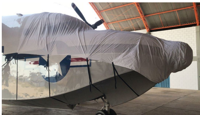
Grumman HU-16 Albatross Cockpit/Nose Cover (test fit cover)