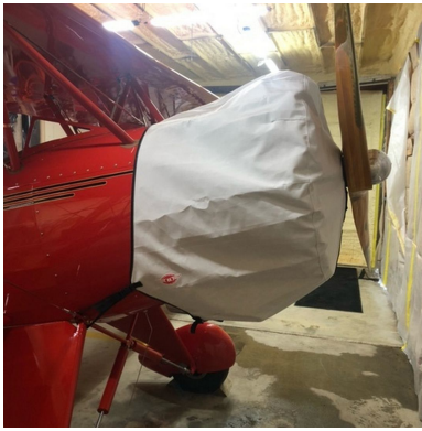
Hatz Biplane CB-1 Engine Cover