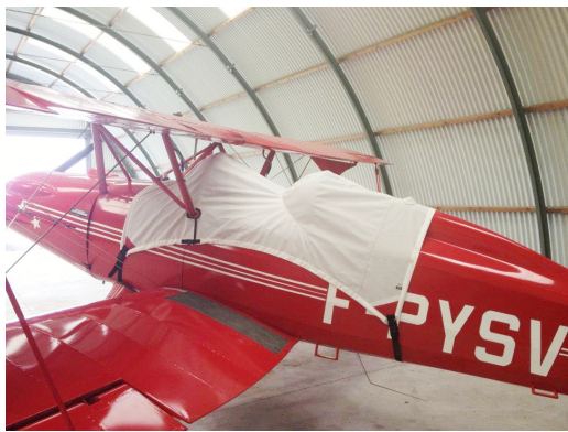
Starduster Too Canopy Cover