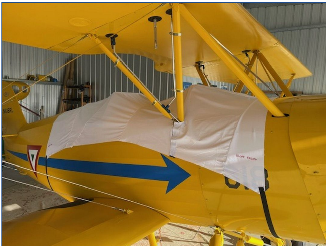
Hatz CB-1 Canopy Cover, test fit