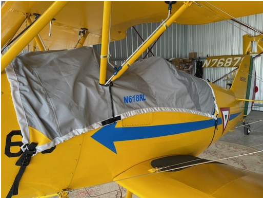
HATZ CB-1 Travel Cover, Light Weight Canopy Cover