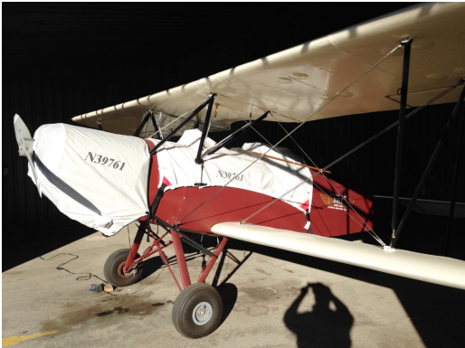
Hatz Biplane Canopy and Engine Covers

This cover type is made from Silver Acrylic Sunbrella canvas and is 100% lined with a soft and smooth microfiber. Bruce's Custom Covers developed this material combination especially for aircraft protection. The outer material is medium weight and treated for water resistance, UV resistance and anti-static buildup. The inner lining is a very soft and smooth microfiber to prevent scratching. The material is very reflective, and tests show that the cabin interior temperature can be reduced to near-ambient temperature on the hottest of days. It is water, ice and snow repellent, yet breathable to allow moisture to escape from between the cover and the aircraft surface.