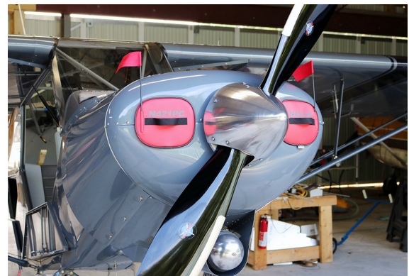
Piper PA-18 Super Cub Engine Inlet Plugs