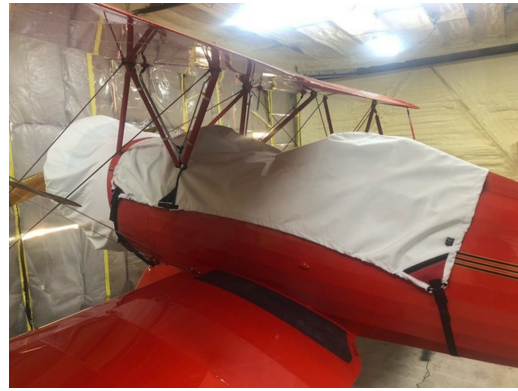
Hatz Biplane CB-1 Canopy Cover & Engine Cover