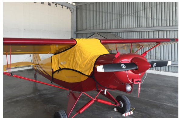
Piper Super Cub Canopy Cover, Engine Plugs