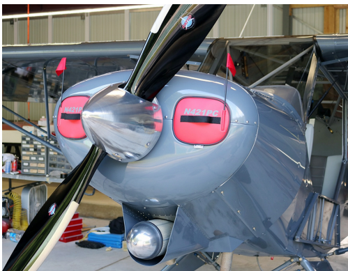
Piper PA-18 Super Cub Engine Inlet Plugs

Engine Inlet Plugs are custom fit for your Hatz Biplane CB-1 intakes, made with heavy-duty vinyl material, and stuffed with a single block of sculpted urethane foam. Each plug has a zipper that allows the foam to be removed and dried if necessary. Engine plugs have warning flags that are visible from the cockpit or 'remove before flight' streamers sewn onto the face of the plugs. Most plugs are imprinted with the aircraft registration number in black for an extra charge. Storage bag NOT included. Engine plugs may be inserted after flight when the engine is still warm. Engine Inlet Plugs are commonly referred to as Cowl Plugs, Intake Plugs, Cowl Blocks, Engine Blocks, and Engine Bungs.