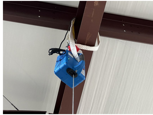
Stearman PT-13 Full Body Dust Cover, Remote Control Winch