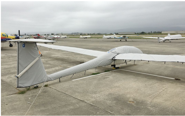
DG-505 Canopy/Nose, Wing, Empennage & Horiz. Stab. Covers

WINTER USE MATERIAL - Made with Solution-Dyed Polyester fabric, this option is intended for seasonal use to aid in deicing, rain mitigation, or for occasional travel. The material is lighter and more compact, but more susceptible to UV damage and may have a shorter useful life if used continuously outside than the all-year use material.