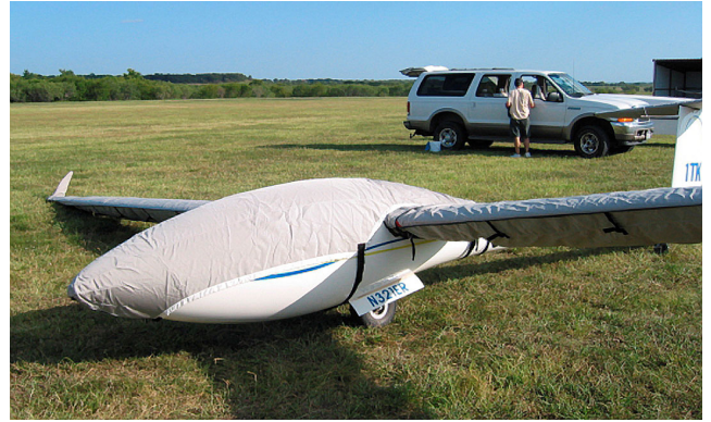
Canopy/Nose Cover, Wings and Horizontal Stab Covers