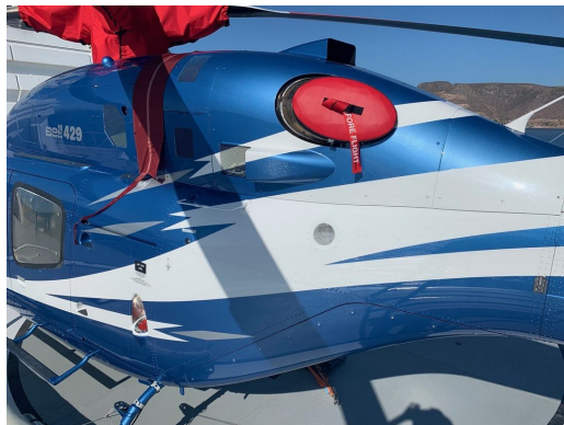
Bell 429 Exhaust Plug

The Engine Exhaust Plugs are custom fit for your Eagle R&D Helicycle exhaust openings, made with heavy-duty vinyl material, and stuffed with a single block of sculpted urethane foam. Exhaust plugs have 'Remove Before Flight' streamers sewn onto the face of the plugs. Exhaust plugs may be inserted soon after flight when the engine is still warm. Engine Inlet Plugs are commonly referred to as Cowl Plugs, Intake Plugs, Cowl Blocks, Engine Blocks, and Engine Bungs.