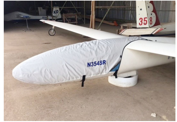
HBV-Diamant 16.5 Canopy/Nose Cover