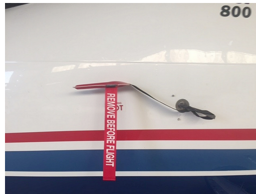
Hawker Beechcraft 800, 800XP, 850XP Pitot Covers With Aoa Straps

The Engine Inlet Plugs are custom fit for your Hawker Beechcraft 900XP intakes, made with heavy-duty vinyl material, and stuffed with a single block of sculpted urethane foam. Each plug has a zipper that allows the foam to be removed and dried if necessary. Engine plugs have 'remove before flight' streamers sewn onto the face of the plugs. Most plugs are imprinted with the aircraft registration number in black for an extra charge. Storage bag NOT included. Engine plugs may be inserted after flight when the engine is still warm. Engine Inlet Plugs are commonly referred to as Cowl Plugs, Intake Plugs, Cowl Blocks, Engine Blocks, and Engine Bungs.