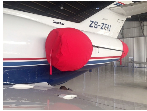
Hawker Beechcraft 800, 800XP, 850XP Engine Covers (With Tr's)