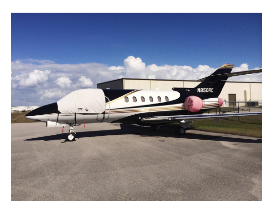
Hawker 800 Cockpit Cover, extended aft 24"