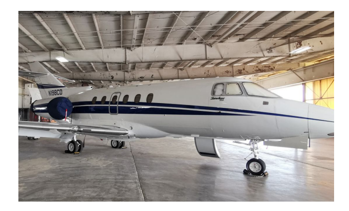
Hawker 750 HeatShields & Engine Covers

Cockpit Heatshields are interior sunshades for the aircraft's cockpit. The product is a unique composite of closed-cell foam with a silver mylar finish. The semi-rigid design is stiff enough to stand inside the window framing. The set folds up flat and is easily stored in the included storage sleeve. Some designs may require velcro and suction cups. Our Heatshields for jets are offered white side out because some aircraft manufacturers have issued advisories against reflective window inserts due to potential heat damage. A Heatshield is an excellent short-term remedy for cockpit overheating, but an external fabric cover is more effective for long-term protection.