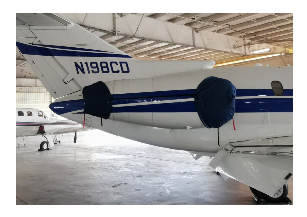
Hawker 750 Engine Covers