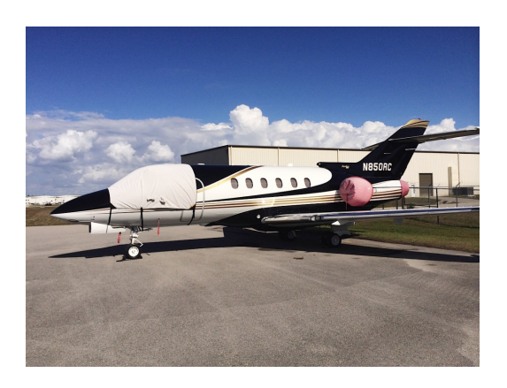
Hawker 800 Cockpit Cover, extended aft 24"