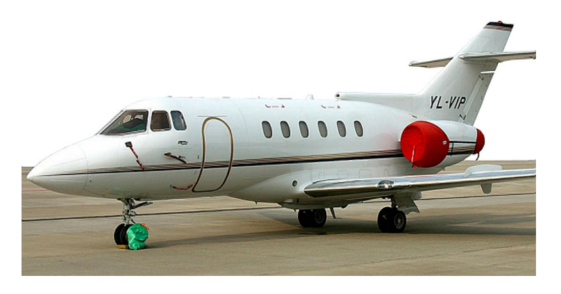
Hawker 700 Tri-Fold Engine Covers