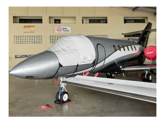
Hawker Beechcraft 750, 800, 800XP, 850XP Cockpit Cover

This cover type is made from Silver Acrylic Sunbrella canvas and is 100% lined with a soft and smooth microfiber. Bruce's Custom Covers developed this material combination especially for aircraft protection. The outer material is medium weight and treated for water resistance, UV resistance and anti-static buildup. The inner lining is a very soft and smooth microfiber to prevent scratching. The material is very reflective, and tests show that the cabin interior temperature can be reduced to near-ambient temperature on the hottest of days. It is water, ice and snow repellent, yet breathable to allow moisture to escape from between the cover and the aircraft surface.