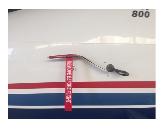
Hawker Beechcraft 800, 800XP, 850XP Pitot Covers With Aoa Straps