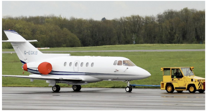
Hawker 800 Tri-Fold Engine Covers.