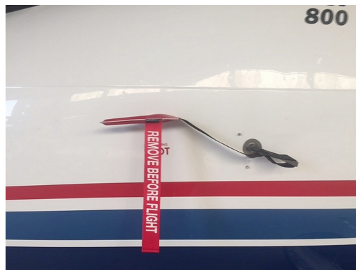
Hawker Beechcraft 800, 800XP, 850XP Pitot Covers With Aoa Straps

The Engine Inlet Plugs are custom fit for your British Aerospace Hawker 700 intakes, made with heavy-duty vinyl material, and stuffed with a single block of sculpted urethane foam. Each plug has a zipper that allows the foam to be removed and dried if necessary. Engine plugs have 'remove before flight' streamers sewn onto the face of the plugs. Most plugs are imprinted with the aircraft registration number in black for an extra charge. Storage bag NOT included. Engine plugs may be inserted after flight when the engine is still warm. Engine Inlet Plugs are commonly referred to as Cowl Plugs, Intake Plugs, Cowl Blocks, Engine Blocks, and Engine Bungs.