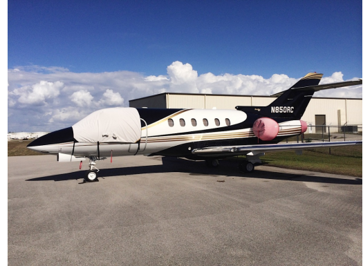
Hawker 800 Cockpit Cover, extended aft 24"