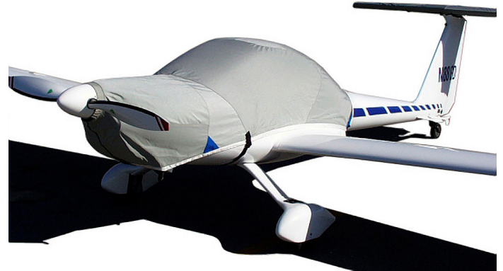
Diamond DA-20 Canopy/Engine Cover