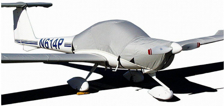
Diamond DA-20 Canopy/Engine, Wing & Horiz. Stab. Covers

The Dimona H36 Canopy/Engine Cover is a one-piece cover (100% lined with microfiber) that is a combination of the Canopy Cover and Engine Cover. This cover will enclose the engine cowl and will extend aft to cover all of the windows. This cover type is made from Silver Acrylic Sunbrella canvas and is 100% lined with a soft and smooth microfiber. Bruce's Custom Covers developed this material combination especially for aircraft protection. The outer material is medium weight and treated for water resistance, UV resistance and anti-static buildup. The inner lining is a very soft and smooth microfiber to prevent scratching. The material is very reflective, and tests show that the cabin interior temperature can be reduced to near-ambient temperature on the hottest of days. It is water, ice and snow repellent, yet breathable to allow moisture to escape from between the cover and the aircraft surface.