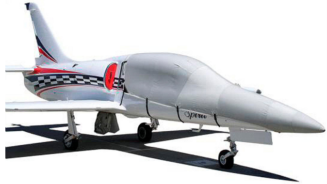
L39 Canopy/Nose Cover & Intake Plugs