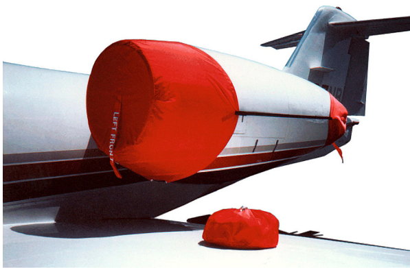
Lear 35 Engine Covers

The Hawker Beechcraft 1000 Intake Covers are designed to install easily yet be completely storable. A spring steel hoop is sewn into the hem of each cover, allowing them to be installed without climbing onto the wing or using a stepladder. To store the covers the spring steel hoop folds like a band-saw blade into three nesting rings. Each cover folds into a compact circular bundle which is stored in the included duffle bag, yet they unfold quickly for use. The Tri-Fold Ring cover is made of medium weight nylon which is available in a variety of colors to match the paint trim. Each cover set comes complete with installation and folding instructions. The aircraft's registration number can be silkscreened onto the cover for an extra charge.