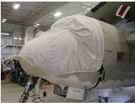
Grumman Tracker Canopy/Nose Cover