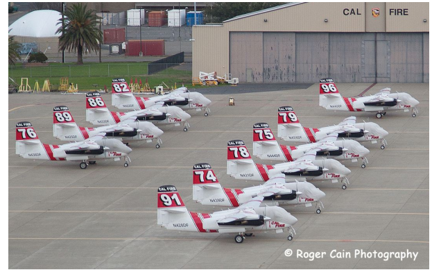
Grumman S-2 Tracker Canopy/Nose Cover