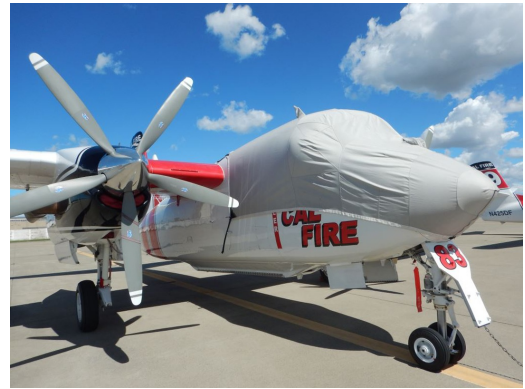
Grumman Tracker Canopy/Nose Cover