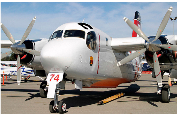
Grumman Tracker Engine Inlet Plugs

Engine Inlet Plugs are custom fit for your Grumman S-2 Tracker intakes, made with heavy-duty vinyl material, and stuffed with a single block of sculpted urethane foam. Each plug has a zipper that allows the foam to be removed and dried if necessary. Engine plugs have warning flags that are visible from the cockpit or 'remove before flight' streamers sewn onto the face of the plugs. Most plugs are imprinted with the aircraft registration number in black for an extra charge. Storage bag NOT included. Engine plugs may be inserted after flight when the engine is still warm. Engine Inlet Plugs are commonly referred to as Cowl Plugs, Intake Plugs, Cowl Blocks, Engine Blocks, and Engine Bungs.