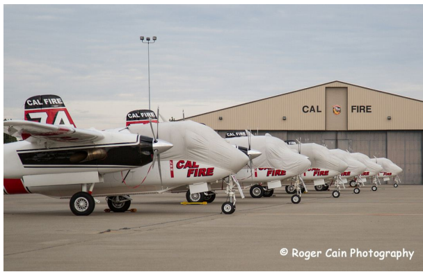
Grumman S-2 Tracker Canopy/Nose Cover