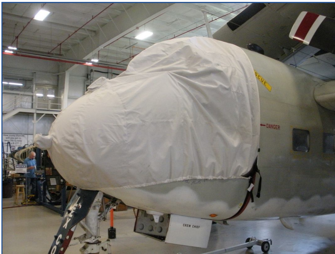
Grumman Tracker Canopy/Nose Cover