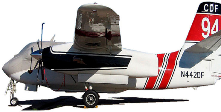
Grumman Tracker (turbine model) Canopy/Nose Cover