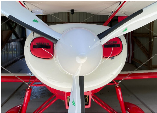
Great Lakes Engine Plugs

Engine Inlet Plugs are custom fit for your Great Lakes Sport Biplane intakes, made with heavy-duty vinyl material, and stuffed with a single block of sculpted urethane foam. Each plug has a zipper that allows the foam to be removed and dried if necessary. Engine plugs have warning flags that are visible from the cockpit or 'remove before flight' streamers sewn onto the face of the plugs. Most plugs are imprinted with the aircraft registration number in black for an extra charge. Storage bag NOT included. Engine plugs may be inserted after flight when the engine is still warm. Engine Inlet Plugs are commonly referred to as Cowl Plugs, Intake Plugs, Cowl Blocks, Engine Blocks, and Engine Bungs.