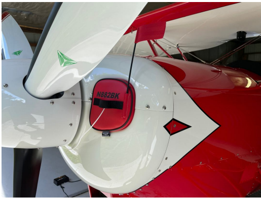
Great Lakes Engine Plugs