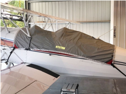
Great Lakes Sport Biplane Canopy Cover, Travel Weight