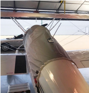
Great Lakes Sport Biplane Canopy Cover, Travel Weight

This cover type is made from Silver Acrylic Sunbrella canvas and is 100% lined with a soft and smooth microfiber. Bruce's Custom Covers developed this material combination especially for aircraft protection. The outer material is medium weight and treated for water resistance, UV resistance and anti-static buildup. The inner lining is a very soft and smooth microfiber to prevent scratching. The material is very reflective, and tests show that the cabin interior temperature can be reduced to near-ambient temperature on the hottest of days. It is water, ice and snow repellent, yet breathable to allow moisture to escape from between the cover and the aircraft surface.