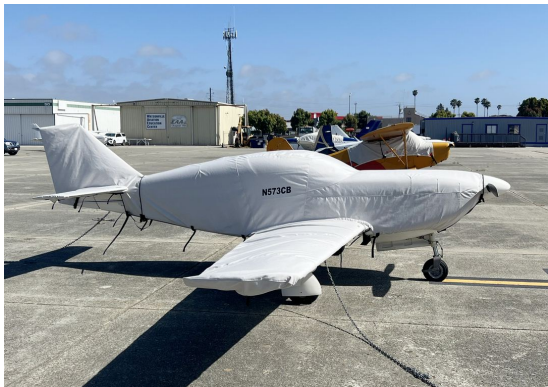
Glasair II Complete Cover Set