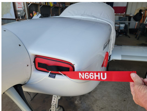
GLASAIR S2-RG Canopy Cover, Engine Plugs

Engine Inlet Plugs are custom fit for your Glasair Aviation Glasair II & III intakes, made with heavy-duty vinyl material, and stuffed with a single block of sculpted urethane foam. Each plug has a zipper that allows the foam to be removed and dried if necessary. Engine plugs have warning flags that are visible from the cockpit or 'remove before flight' streamers sewn onto the face of the plugs. Most plugs are imprinted with the aircraft registration number in black for an extra charge. Storage bag NOT included. Engine plugs may be inserted after flight when the engine is still warm. Engine Inlet Plugs are commonly referred to as Cowl Plugs, Intake Plugs, Cowl Blocks, Engine Blocks, and Engine Bungs.