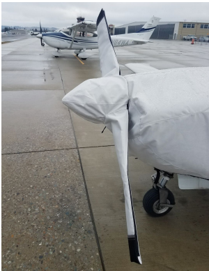
Glasair Aviation Glasair II & III Propellor/Spinner Cover, 2 Blade