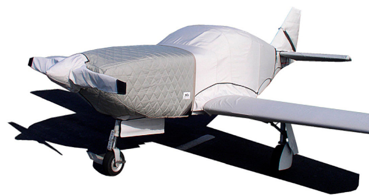
Glasair I Insulated Engine Cover, Prop Cover, Etc.

This cover type is made from Silver Acrylic Sunbrella canvas and is 100% lined with a soft and smooth microfiber. Bruce's Custom Covers developed this material combination especially for aircraft protection. The outer material is medium weight and treated for water resistance, UV resistance and anti-static buildup. The inner lining is a very soft and smooth microfiber to prevent scratching. The material is very reflective, and tests show that the cabin interior temperature can be reduced to near-ambient temperature on the hottest of days. It is water, ice and snow repellent, yet breathable to allow moisture to escape from between the cover and the aircraft surface.