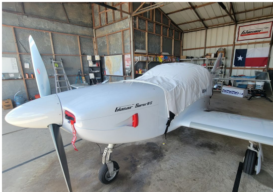
GLASAIR S2-RG Canopy Cover, Engine Plugs

This cover type is made from Silver Acrylic Sunbrella canvas and is 100% lined with a soft and smooth microfiber. Bruce's Custom Covers developed this material combination especially for aircraft protection. The outer material is medium weight and treated for water resistance, UV resistance and anti-static buildup. The inner lining is a very soft and smooth microfiber to prevent scratching. The material is very reflective, and tests show that the cabin interior temperature can be reduced to near-ambient temperature on the hottest of days. It is water, ice and snow repellent, yet breathable to allow moisture to escape from between the cover and the aircraft surface.