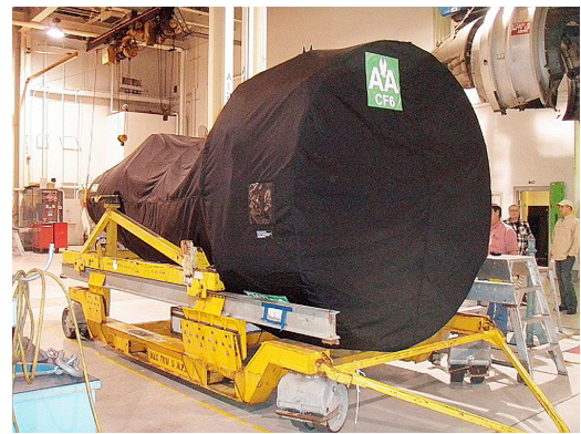
GE CF-6 QEC Engine Long-term Storage/Transport Cover (Boeing 767)