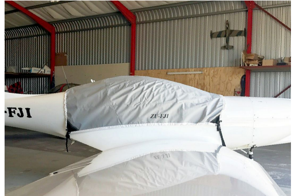
Gobosh 800XP Travel Cover, Light Weight Travel Canopy Cover