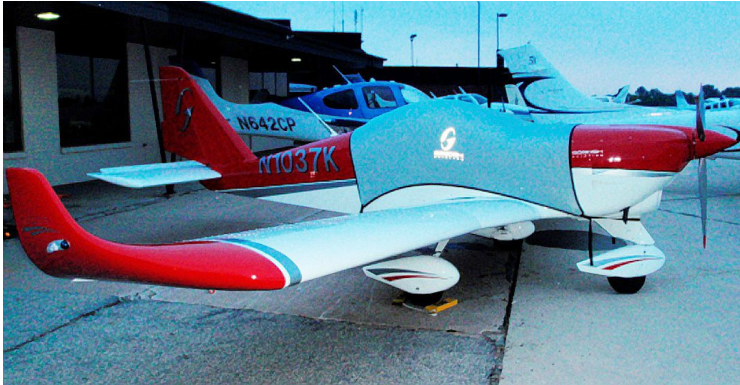
Gobosh Light Weight Travel-Cover

Travel Covers are made with Silver Solution-Dyed Polyester fabric and only lined over the windshield to save weight. The material is lightweight and more compact for easy stowage in the aircraft. The polyester material is water resistant, but only intended for occasional use outside. We also have an ultra lightweight material available for fitted hangar dust covers. For daily outdoor use, the non-travel Sunbrella Cover is the best choice.