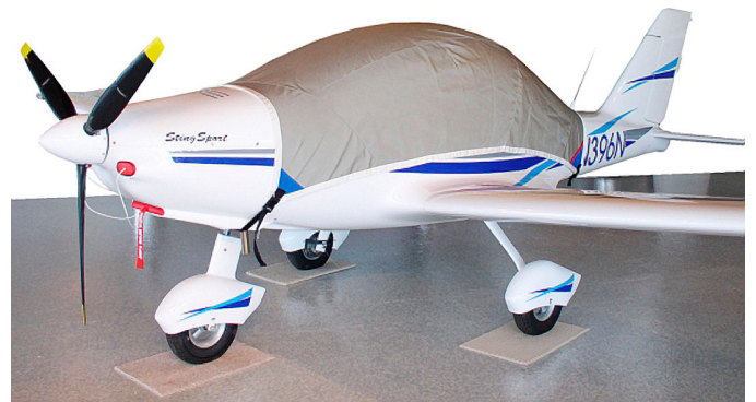
Sting Sport Canopy Cover & Engine Plugs