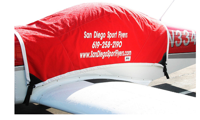
Gobosh Canopy Cover with custom Imprint