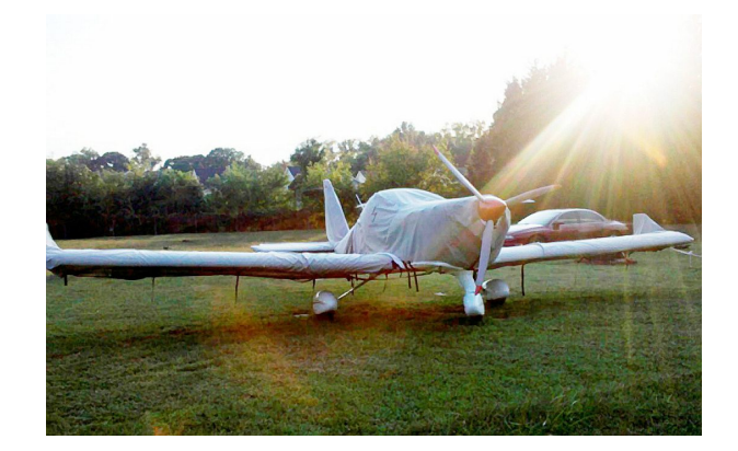
Gobosh Full Cover Set