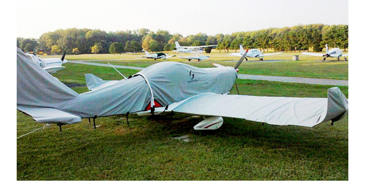
Gobosh Full Cover Set

WINTER USE MATERIAL - Made with Solution-Dyed Polyester fabric, this option is intended for seasonal use to aid in deicing, rain mitigation, or for occasional travel. The material is lighter and more compact, but more susceptible to UV damage and may have a shorter useful life if used continuously outside than the all-year use material.