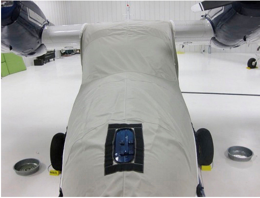
Grumman Widgeon Cockpit/Nose Cover, tie-down cleat detail

Canopy Covers are commonly referred to as Cabin Covers, Fuselage Covers, Canvas Covers, Canopy Caps, etc.