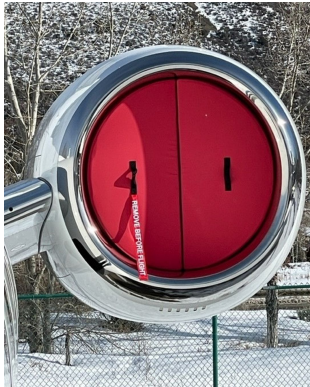
Gulfstream Aerospace Gulfstream GVII (G400,

The Engine Inlet Plugs are custom fit for your Gulfstream Aerospace Gulfstream GVII (G400, G500, G600, G700, G800) intakes, made with heavy-duty vinyl material, and stuffed with a single block of sculpted urethane foam. Each plug has a zipper that allows the foam to be removed and dried if necessary. Engine plugs have 'remove before flight' streamers sewn onto the face of the plugs. Most plugs are imprinted with the aircraft registration number in black for an extra charge. Storage bag NOT included. Engine plugs may be inserted after flight when the engine is still warm. Engine Inlet Plugs are commonly referred to as Cowl Plugs, Intake Plugs, Cowl Blocks, Engine Blocks, and Engine Bungs.