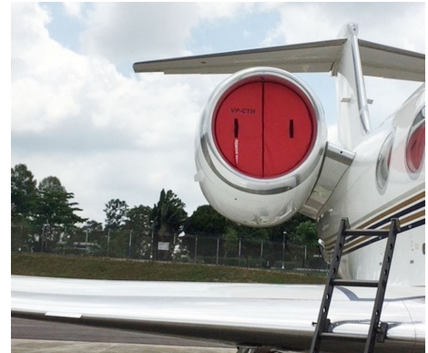
Grumman Gulfstream G450 Intake Plugs