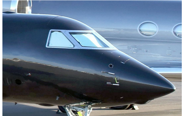
Gulfstream Cockpit Heatshields