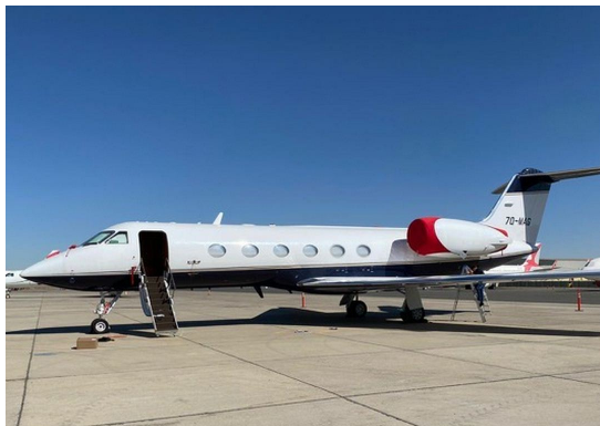
Grumman Gulfstream G-IV SP Engine Cover, bikini type

The Gulfstream Aerospace Gulfstream GVII (G400, G500, G600, G700, G800) Bikini Style Engine Covers are a single-piece design using a soft and smooth stretchy fabric. The cover stretches tightly over both the intake and exhaust, installing quickly and easily. These covers are designed to be used as hangar dust covers and have a useful life of approximately one year.