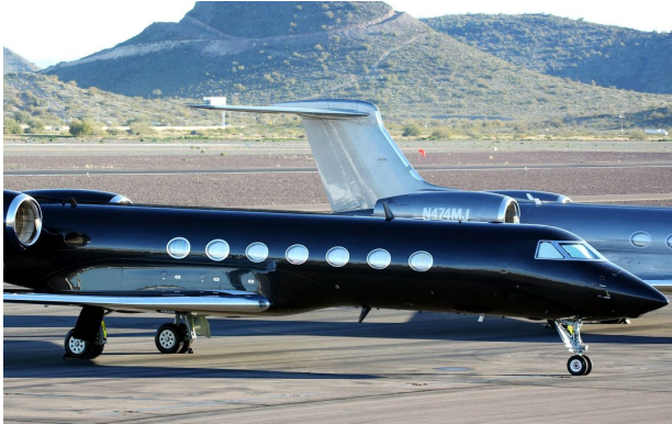
Gulfstream Cockpit Heatshields

Cockpit Heatshields are interior sunshades for the aircraft's cockpit. The product is a unique composite of closed-cell foam with a silver mylar finish. The semi-rigid design is stiff enough to stand inside the window framing. The set folds up flat and is easily stored in the included storage sleeve. Some designs may require velcro and suction cups. Our Heatshields for jets are offered white side out because some aircraft manufacturers have issued advisories against reflective window inserts due to potential heat damage. A Heatshield is an excellent short-term remedy for cockpit overheating, but an external fabric cover is more effective for long-term protection.