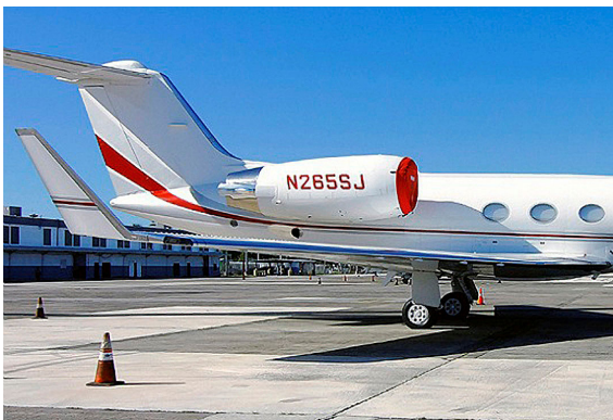
Gulfstream G-IV Intake Covers

The Gulfstream Aerospace Gulfstream IV (C-20G), G350, G450 Intake Covers are designed to install easily yet be completely storable. A spring steel hoop is sewn into the hem of each cover, allowing them to be installed without climbing onto the wing or using a stepladder. To store the covers the spring steel hoop folds like a band-saw blade into three nesting rings. Each cover folds into a compact circular bundle which is stored in the included duffle bag, yet they unfold quickly for use. The Tri-Fold Ring cover is made of medium weight nylon which is available in a variety of colors to match the paint trim. Each cover set comes complete with installation and folding instructions. The aircraft's registration number can be silkscreened onto the cover for an extra charge.