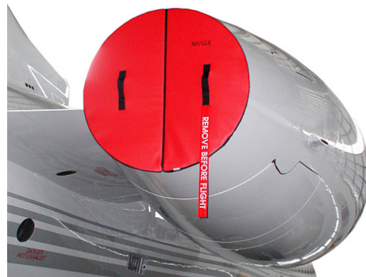
Grumman Gulfstream Exhaust Plugs, folding type