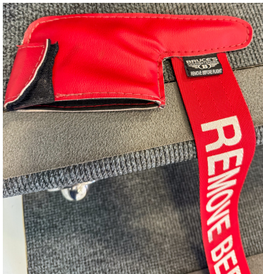
Gulfstream IV Pitot Cover

The Engine Inlet Plugs are custom fit for your Gulfstream Aerospace Gulfstream IV (C-20G), G350, G450 intakes, made with heavy-duty vinyl material, and stuffed with a single block of sculpted urethane foam. Each plug has a zipper that allows the foam to be removed and dried if necessary. Engine plugs have 'remove before flight' streamers sewn onto the face of the plugs. Most plugs are imprinted with the aircraft registration number in black for an extra charge. Storage bag NOT included. Engine plugs may be inserted after flight when the engine is still warm. Engine Inlet Plugs are commonly referred to as Cowl Plugs, Intake Plugs, Cowl Blocks, Engine Blocks, and Engine Bunges.