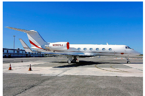
Gulfstream G-IV Intake Covers