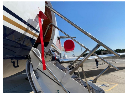
Grumman Gulfstream G-IV SP Pitot Cover