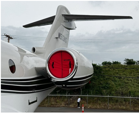
Gulfstream G280 Intake Plugs