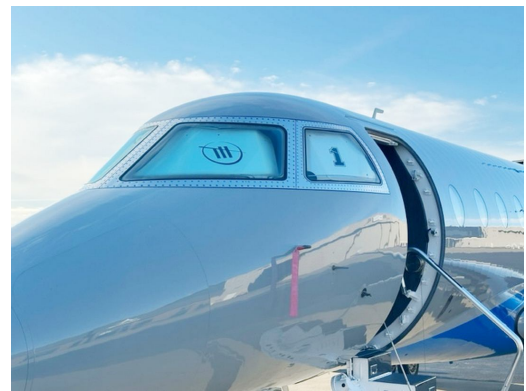
Gulfstream G200 Cockpit Heatshields