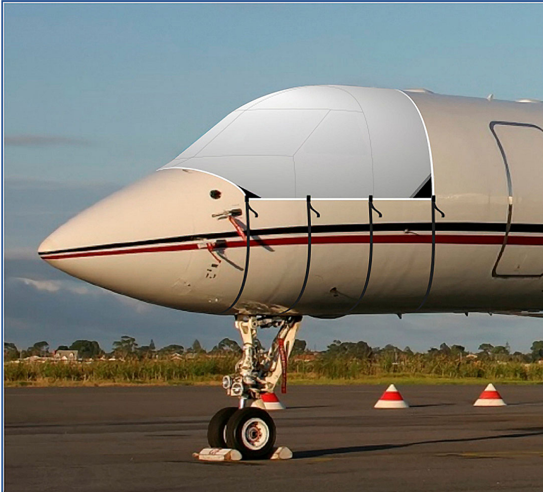
G-V Cockpit/Windshield Cover (Illustration)