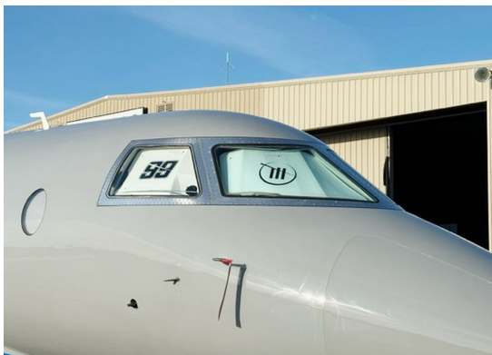
Gulfstream G200 Cockpit Heatshields

Cockpit Heatshields are interior sunshades for the aircraft's cockpit. The product is a unique composite of closed-cell foam with a silver mylar finish. The semi-rigid design is stiff enough to stand inside the window framing. The set folds up flat and is easily stored in the included storage sleeve. Some designs may require velcro and suction cups. Our Heatshields for jets are offered white side out because some aircraft manufacturers have issued advisories against reflective window inserts due to potential heat damage. A Heatshield is an excellent short-term remedy for cockpit overheating, but an external fabric cover is more effective for long-term protection.