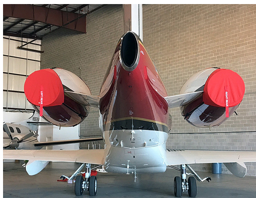
Canadair Challenger 300 Intake/Exhaust Covers, 3-Strap Type