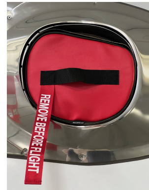
Gulfstream V APU Exhaust Plug