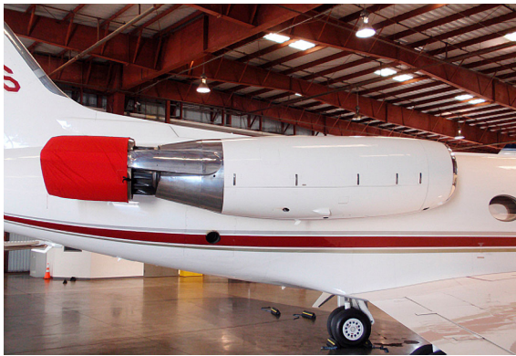
Stage III Quiet Technologies Hush Kit Cover

The Gulfstream Aerospace Gulfstream II, III (C-20D) Intake Covers are designed to install easily yet be completely storable. A spring steel hoop is sewn into the hem of each cover, allowing them to be installed without climbing onto the wing or using a stepladder. To store the covers the spring steel hoop folds like a band-saw blade into three nesting rings. Each cover folds into a compact circular bundle which is stored in the included duffle bag, yet they unfold quickly for use. The Tri-Fold Ring cover is made of medium weight nylon which is available in a variety of colors to match the paint trim. Each cover set comes complete with installation and folding instructions. The aircraft's registration number can be silkscreened onto the cover for an extra charge.