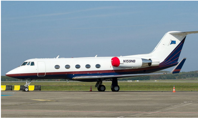
Grumman Gulfstream II Intake Covers

The Gulfstream Aerospace Gulfstream II, III (C-20D) Intake Covers are designed to install easily yet be completely storable. A spring steel hoop is sewn into the hem of each cover, allowing them to be installed without climbing onto the wing or using a stepladder. To store the covers the spring steel hoop folds like a band-saw blade into three nesting rings. Each cover folds into a compact circular bundle which is stored in the included duffle bag, yet they unfold quickly for use. The Tri-Fold Ring cover is made of medium weight nylon which is available in a variety of colors to match the paint trim. Each cover set comes complete with installation and folding instructions. The aircraft's registration number can be silkscreened onto the cover for an extra charge.