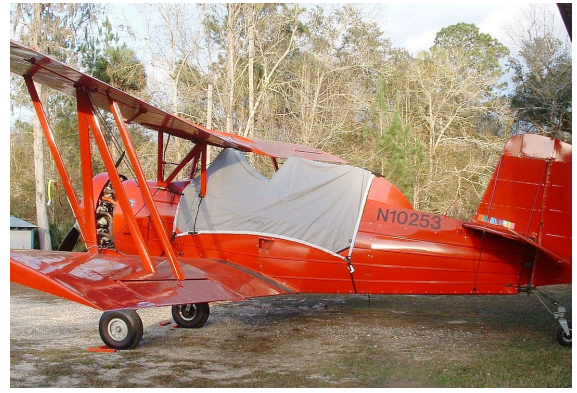
Grumman Ag Cat G-164, Open Cockpit, Canopy Cover