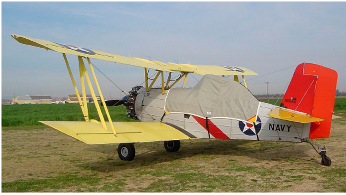
Canopy Cover for the Grumman Ag Cat