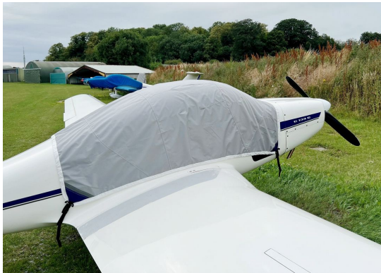
Grob 109 Travel Cover, Light Weight Canopy Cover