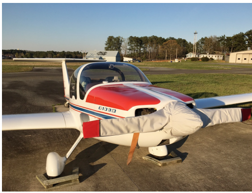
Grob 109 Prop Cover