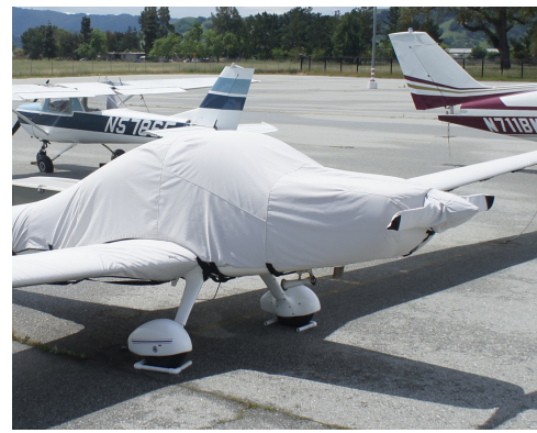
Grob 109 Prop Cover