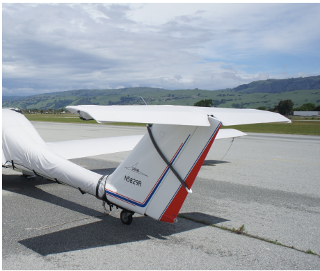
Grob 109 Horizontal Stabilizer Cover

WINTER USE MATERIAL - Made with Solution-Dyed Polyester fabric, this option is intended for seasonal use to aid in deicing, rain mitigation, or for occasional travel. The material is lighter and more compact, but more susceptible to UV damage and may have a shorter useful life if used continuously outside than the all-year use material.