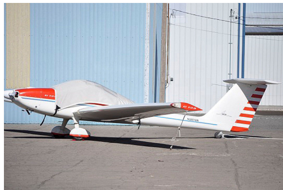
Grob 109 Canopy Cover