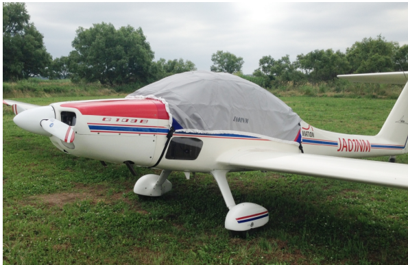
Grob 109 Travel Cover, Light Weight Travel Canopy Cover