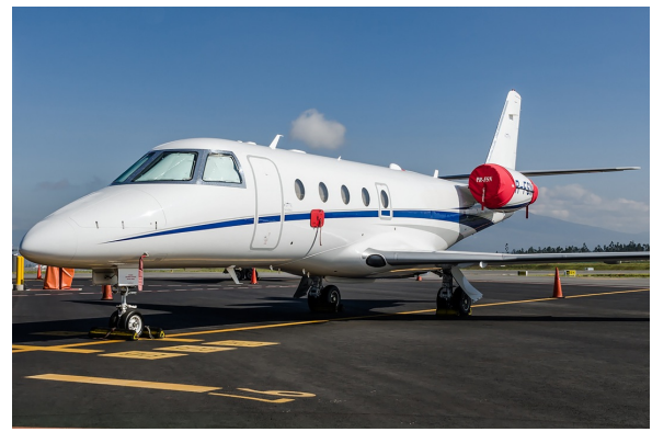
Gulfstream G150 Engine Covers, Cockpit HeatShields