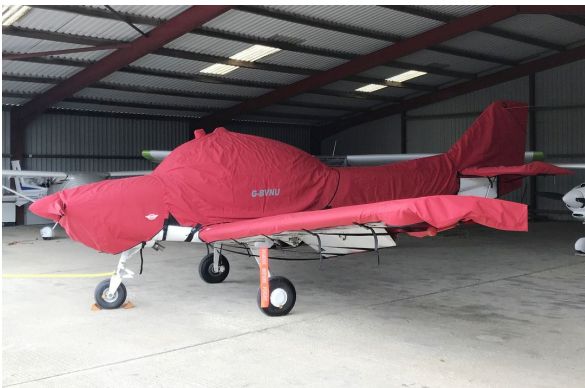
FLS Club Sprint Engine Cover

WINTER USE MATERIAL - Made with Solution-Dyed Polyester fabric, this option is intended for seasonal use to aid in deicing, rain mitigation, or for occasional travel. The material is lighter and more compact, but more susceptible to UV damage and may have a shorter useful life if used continuously outside than the all-year use material.