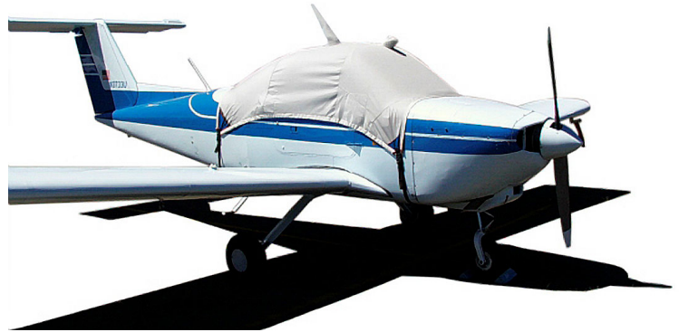
Canopy Cover for Beech Skipper