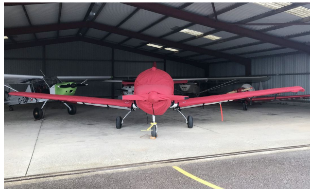
FLS Club Sprint Empennage Cover (Tailboom, Vertical & Horiz Stabilizers) All Year Use