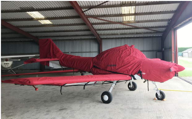
FLS Club Sprint Extended Canopy Cover

Engine Covers will cinch around or behind the spinner, cover the entire engine cowl area including the engine air cooling and induction air inlets, and fastens together with Velcro beneath the spinner down the front of the cowling. The Engine Cover is attached with a belly strap aft of the firewall, and can Velcro to the Canopy Cover. Engine Covers are normally made from Solution-Dyed Polyester or Acrylic Sunbrella . An Insulated version of the engine cover can be made with a thicker, quilted, and water-repellent material. The Insulated Engine Cover works well in cold climates to help with engine preheating.